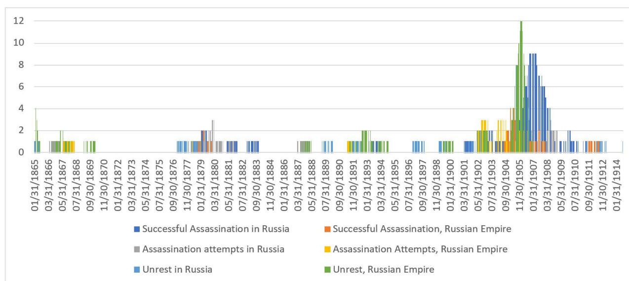
Figure 2. Months within the past year with an event of political violence. Note: Bars show the number of months in the year preceding a particular month in which at least one episode of that type of political violence occurred (meaning a minimum of 0 if no violence occurred to a maximum of 12 if at least one act occurred in each month of the preceding year). Political violence broken out by assassination attempts, successful assassinations and unrest (collective violence) in both Russia proper and in the Russian Empire only (Ukraine, the Caucasus, conquered Poland and the Baltic States). More detail available at Hartwell (2020).

Note: p -values for tests shown under the null of a unit root and the alternative of a stationary nonlinear ESTAR model. ***, ** and * for p -values denote significance at the 1%, 5% and 10% levels respectively. Fixed: fixed lag length chosen by Schwert (1989) maximum. AIC = Akaike Information Criterion. SIC: Schwarz Information Criterion. GTS05 and GTS10: General to specific algorithm with significance level set at 5% or 10%, respectively. See Otero and Smith (2017).