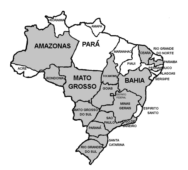
Figure 1. Brazilian Federative Units that received the questionnaire (in grey).

Eighty-one valid questionnaires were obtained, that is, 72.3%. The responses were treated by FA.