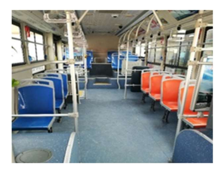
Figure 3. Skywell brand.