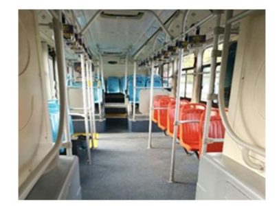
Figure 1. BYD brand.