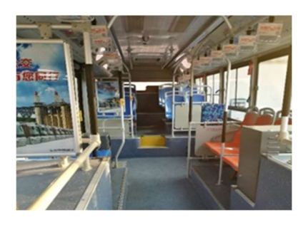
Figure 4. Jiankang brand.