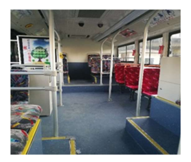
Figure 2. Yinlong brand.