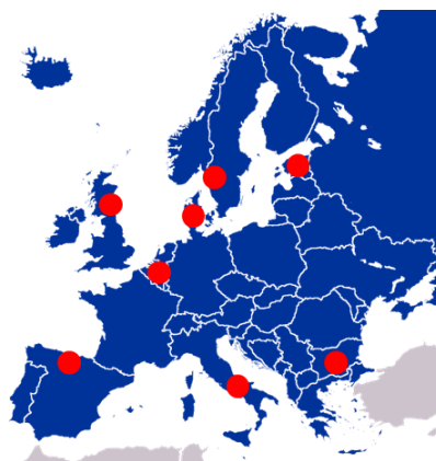
Figure 3. General location of the eight case cities in Europe.

Based on these two projects, eight cities were selected since they demonstrate ambition to become decarbonised and to practice energy planning. These cities began with SEAPs but graduated with individual methods. Urban planning in different countries will differ due to differing local conditions such as institutional and political arrangements, horizontally and vertically [30]. However, this analysis investigates the regime change at the strategic level, with the expectation that each country is the same strategically, although planning practices and geographical conditions may differ under the strategy.