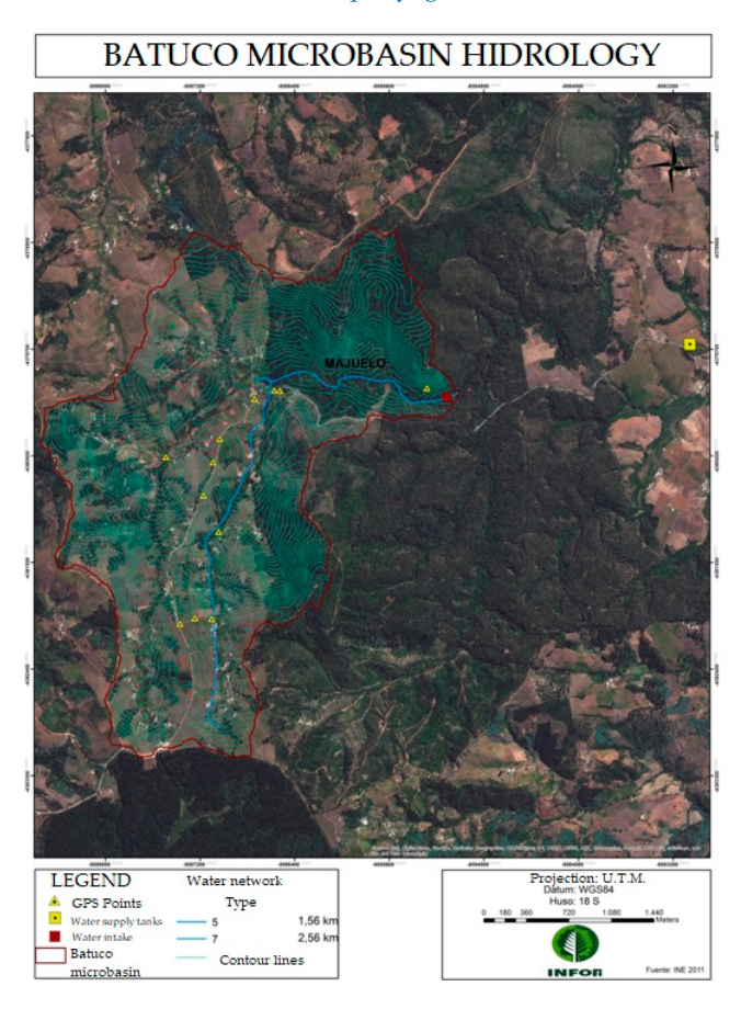
Figure 2. Water supply system (light blue), water intake area (red dot), and supply pumps (yellow square) of Batuco Water Committee, Global Positioning System (GPS) points (yellow triangle).