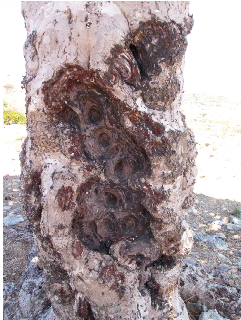
Figure 4. Typical wounded stem of a dragon tree, causing mistakes in repeated DBH measurements.

negative values. Variability within the 95% confidence interval includes that caused by this error in repeated measurement. Removing negative values from our model resulted in an increase in R^2 to 0.1, which means that the model explained 10% of the data variability. However, we considered using negative values in our model, because the same DBH measurement error could have been made with positive values.