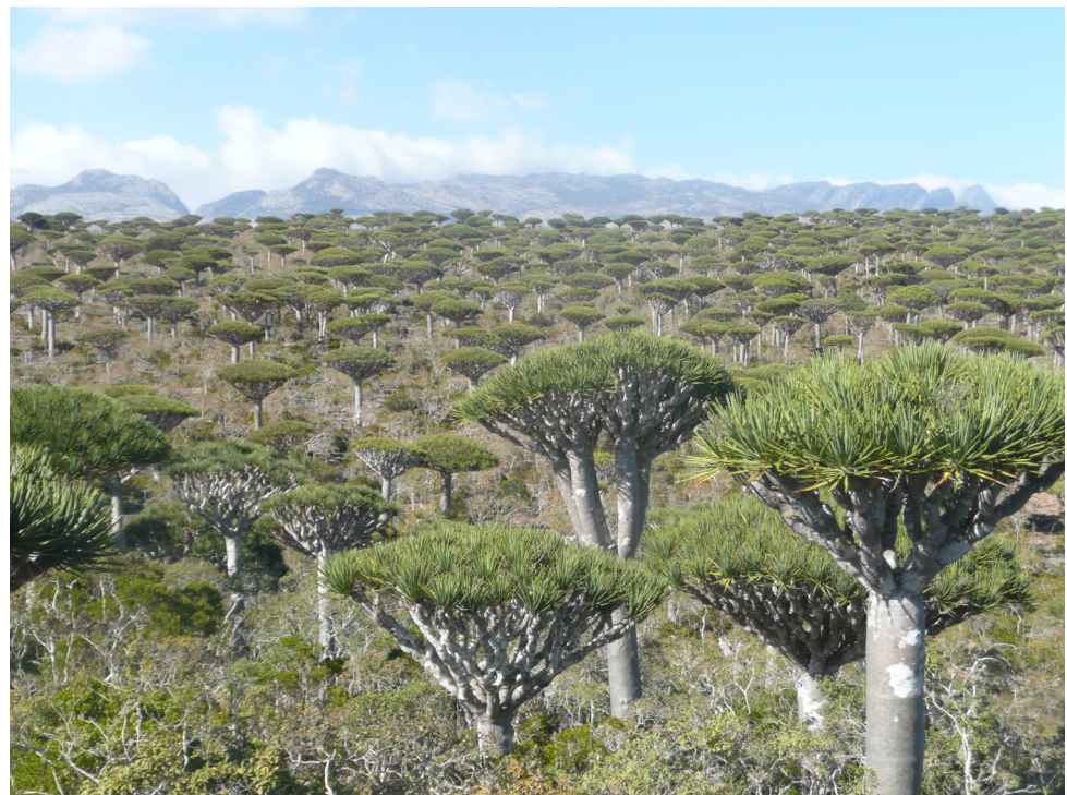
Figure 1. Part of the D. cinnabari forest on Firmihin Plateau.

The measurements were conducted in Firmihin, which is described as a limestone plateau [37] situated in the central–eastern part of Socotra Island [16]. The largest dragon tree forest in the world can be found here [16] (see Figure 1). The D. cinnabari forest in Firmihin is also unique to Socotra Island because this species is quite scattered in other areas. Firmihin reaches an altitude of 400 to 760 m a.s.l. [16,20]. The mean annual temperature is 23.4 °C, and the mean annual precipitation is 344 mm [39]. In terms of vegetation, the evergreen shrub Buxanthus pedicellatus Tiegh. also grows, forming the Buxanthus – Dracaena community; however, D. cinnabari predominates [14].