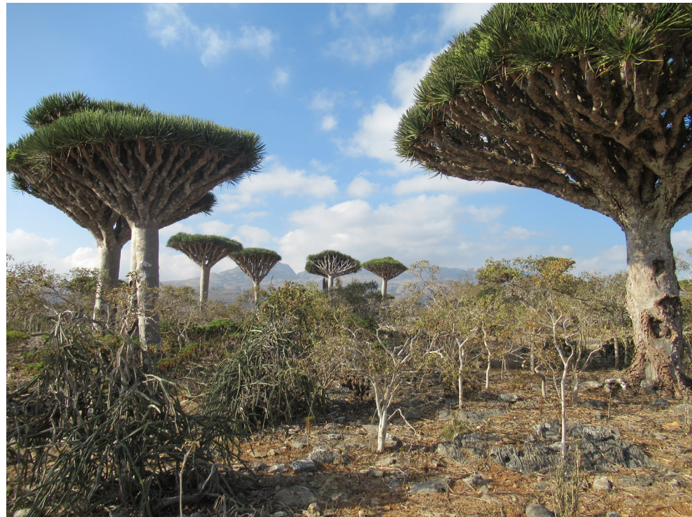
Figure 2. One of the monitoring plots in Firmihin (L. Bauerová, 2021).

ArcGIS Collector app helped with navigation by GPS using a mobile phone. The DBH classes (in Results section) were derived from the DBH measured in 2011. Overall, 90 plots were visited, and 1077 trees were measured in total. Seventeen monitoring plots were not measured, for different reasons. Some of them were destroyed by landslides caused by cyclones in 2015 and 2018. In some cases, we were not able to identify the measured trees within the plots, especially in those with high tree density, because the accuracy of the mobile GPS was insufficient to find the exact positions of the plot centers which were needed.