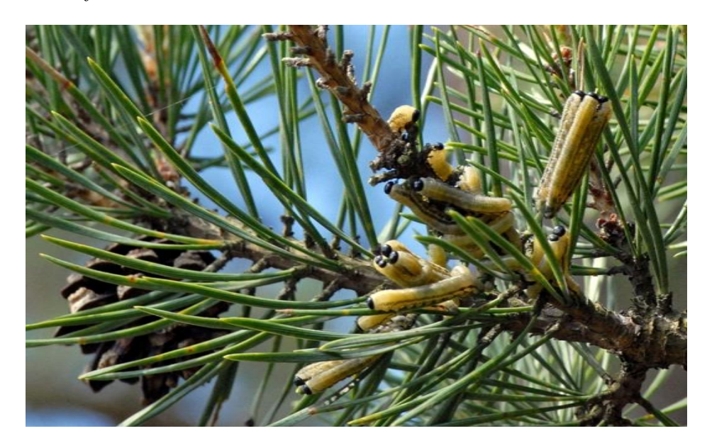
Figure 1. Gregariousness or group-living is typical for outbreak species among needle-eating lepidopterans and sawflies, here represented by the European pine sawfly, Neodiprion sertifer .

The body size and gallery length might be indicators of reproductive output, since larger individuals of a given species are thought to have a larger egg load [33] and gallery length might be an indicator of the number of larvae in a gallery. If so, the longer galleries and the difference in size between outbreak and non-outbreak species may indicate that that the former generally have higher reproduction potential than the latter.