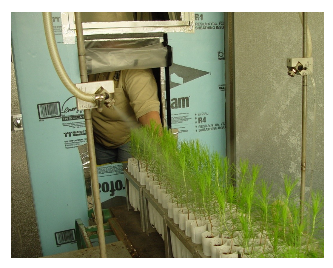
Figure 1. Concentrated Basidiospore Spray (CBS) inoculation system used at the Resistance Screening Center. As trays of seedlings in their individual plastic tubes move along a conveyor belt, seedlings are sprayed with the concentrated basidiospore suspension. After inoculation, the trays of seedlings are immediately placed in the controlled temperature and high humidity incubation chamber. After 24 h in the chamber they are removed to a holding area where they are allowed to equilibrate with normal room conditions for an additional 24 h. Seedlings are then transferred to greenhouses were they remain for 6 months until inspection for fusiform rust symptoms and reports to clients who submitted their seed lots for evaluation for resistance to fusiform rust.

The main purpose of this meeting was review of the plan Peter Laird had developed for the "Pilot Test" of screening center operations beginning in May 1972. The plan was titled "An Evaluation of a Method Designed to Evaluate Fusiform Rust resistance in Slash and Loblolly pines" [24]. Several suggestions for improvement of the plan were made by Committee members.