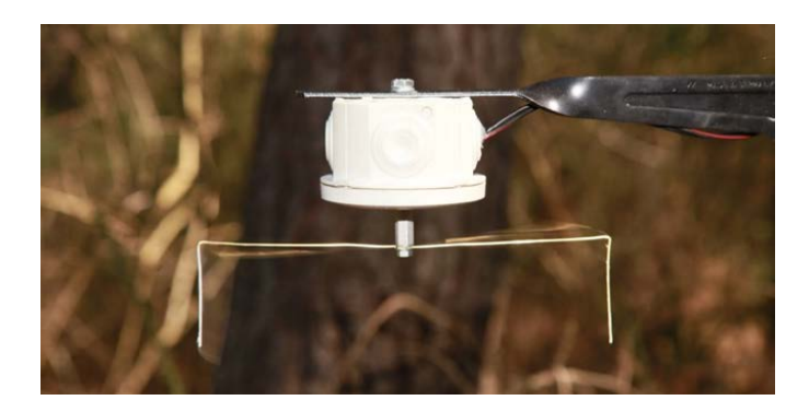
Figure 1. Running spore trap (ROTTRAP 120) coated with double-sided tape on the impaction side of the square section wire.

Actively rotating arm spore traps ROTTRAP 120 (Miloň Dvořák, Boršov nad Vltavou, Czech Republic) were used for all the experiments. The construction of this spore trap is based on the description of Perkins and Leighton [30] and McCartney et al. [31]. An electric motor rotates 2400 rpm with a 0.8 mm thick U-shaped, square section wire (Figure 1). The vertical impactors of 50 mm in length distanced at 200 mm were covered for every sampling with a new double-sided non-woven tape (Tesa SE, Norderstadt, Germany). Covering the front side (according to the direction of rotation) of each impactor, the spore trap provided an impaction area of 80 mm<sup>2</sup>. According to equations of Noll [32], the spore traps sample the air at a speed of 120 L·min<sup>-1</sup> with almost a 100% collecting efficiency for particles bigger than 7.18 \mu m. Each trap was mounted 1.4 m high and powered by a 12 V/19 Ah battery.