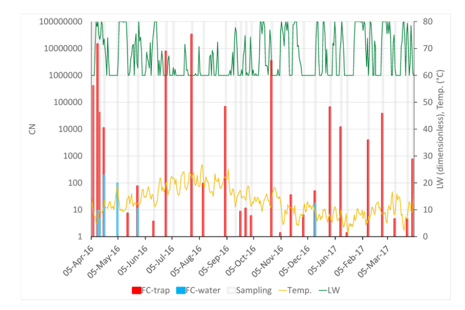
Figure 2. Variation of meteorological variables and abundance of Fusarim circinatum spores across the whole sampling year. The X-axis shows the progress of time. "FC-trap" values (left Y-axis, red columns) display the number of copies of the target sequence in 1 \mu L of template DNA (CN) in a logarithmic scale and reflect the amount of F. circinatum inoculum trapped by the rotating arm spore trap. "FC-water" values (left Y-axis, blue columns) display the CN detected in the samples of rain water. Grey columns mark the 30 sampling periods across the whole year. Temperature ("Temp.", yellow line, °C) and leaf wetness ("LW", green line, scaleless; 60 = dry, 80 = absolutely wet) are shown on an average daily basis and scaled by the right Y-axis.

The results of the sampling are shown in Figure 2. In total, F. circinatum was detected in 27 out of 30 air samplings carried out over one year. The samplings with no F. circinatum detection were noted on 4 May, 6 July, and 14 September. No clear temporal trends were detected. The highest CN (3.28 \times 10^7) was recorded on 27 July, but relatively high values of CN were detected across almost the entire sampling year. During 12 out of the 30 samplings, rain water was collected; six of the water samples were positive. Two negative water sample results confirmed the absence of the inoculum on 6 July and 14 September; however, on 4 May, the inoculum was detected in the water sample and not in the tape of the spore trap.