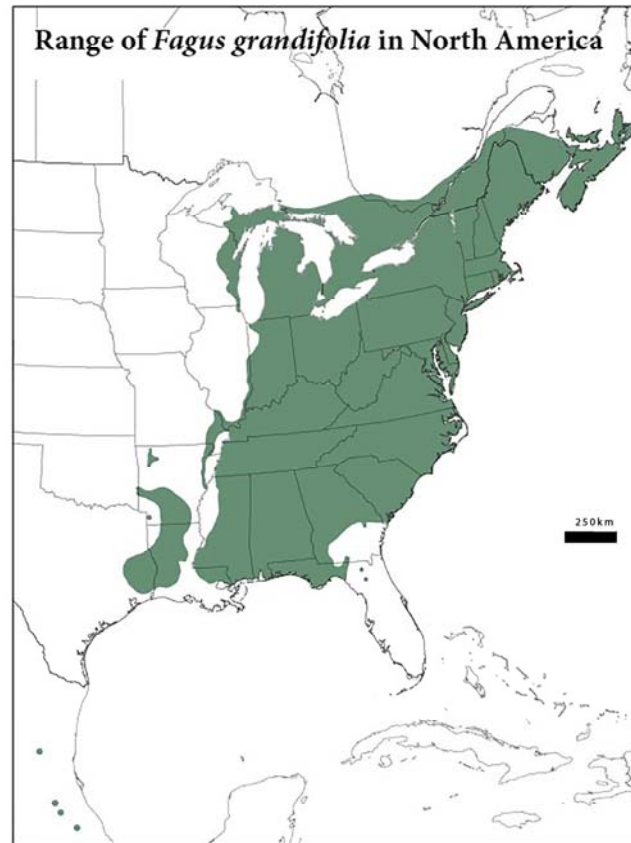
Figure 1. Present geographic distribution of the American Beech. This map was created using ArcGIS and the documented range of American Beech is depicted in green. The data were downloaded from the United States Geological Survey’s Geosciences and Environmental Change center website [5].

beech seems able to tolerate a soil pH ranging from 4.0 to 6.0 and multiple specific soil types, namely those of the orders Alfisol, Oxisol, and Spodosol, though soils with a large humus layer appear to be favored [4,15]. In line with its large geographic distribution, American beech grows in a range of soil conditions.