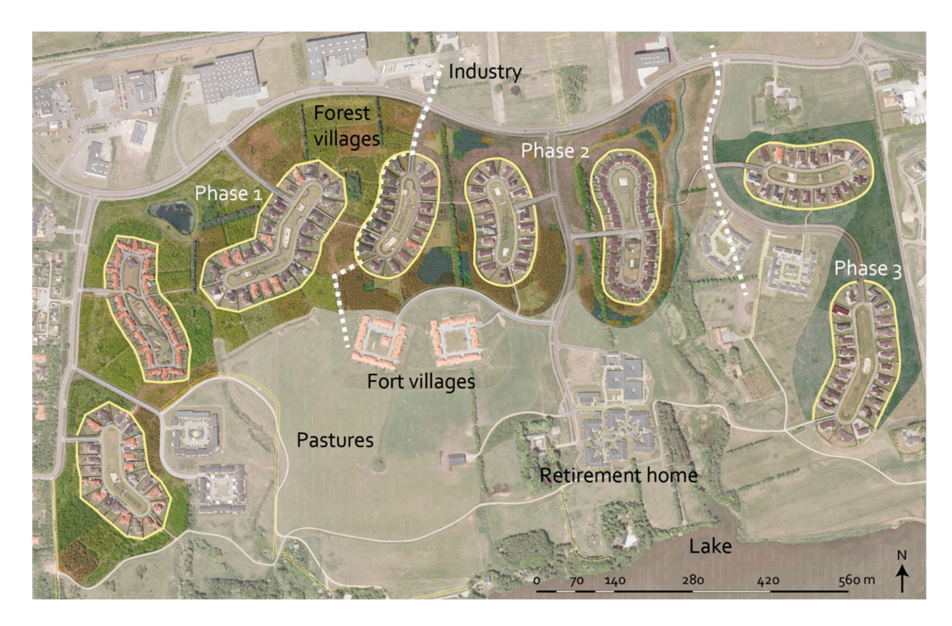
Figure 1. Plan of Sletten. Varied woodland surround the forest villages. The colored fields in the woodland correspond to the 52 different stand types. The yellow border around each forest village shows the stipulated width of the co-management zone, i.e., the first 4 m of the public woodland. Based on an aerial photo, <sup>®</sup>GST.

The woodlands in Sletten were established as a publicly accessible "landscape laboratory" in three phases, in parallel to residential development, in the period of 1999–2004. Landscape laboratories are experimental woodland areas in a local landscape context where innovative design and management concepts for urban forests are tested in full scale [36]. The woodland design comprised 52 stand types and 85 tree and shrub species, resulting in differing appearance (e.g., tree height, planting distance, vegetation structure, and species composition) between different parts of Sletten [32].