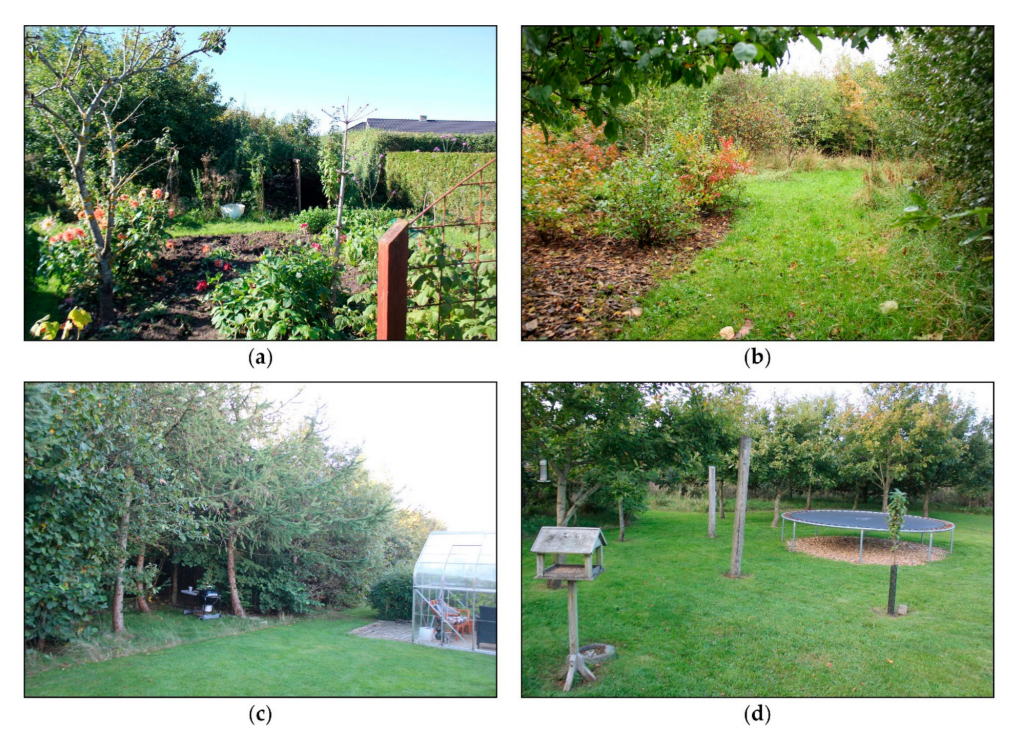
Figure 3. Exemplifying photos of the co-management zone. For each photo, the outcomes that the resident at the address described of their own participation are listed: ( a ) enhancement of private garden, empowerment, food, increased use of urban woodland, relaxation, increased biodiversity, environmental awareness, nature experience, and better accessibility to woodland; ( b ) wind-sheltered environment, food, increased use of urban woodland, relaxation, memories stored in resident-planted trees, increased biodiversity, better appearance, and environmental awareness; ( c ) happiness and pleasure, food, fertilizing the woodland/creating mold, and better usability; ( d ) happiness and pleasure, enhancement of private garden, increased biodiversity, and better appearance.