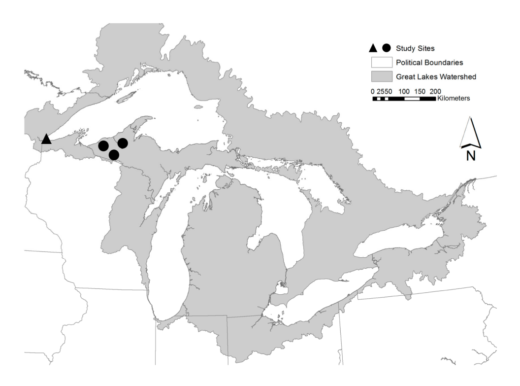
Figure 1. Map of the Great Lakes region with the three study locations in the Ottawa National Forest (●), in the western Upper Peninsula of Michigan, and the one study location in the Superior Municipal Forest (▲), in northwestern Wisconsin. The shaded region is the Great Lakes Watershed with United States and Canadian boundaries.