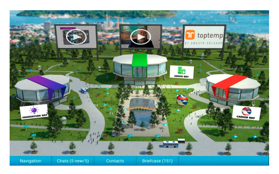
Figure 1. Virtual fair representation (picture courtesy of Global Forums).

Figure 1 shows an example of how a virtual career fair may mirror the characteristics of regular career fairs (picture courtesy of Global Forums). The example highlights how the company incorporates web service analytics and web data visualization to create a service that supports virtual fairs.