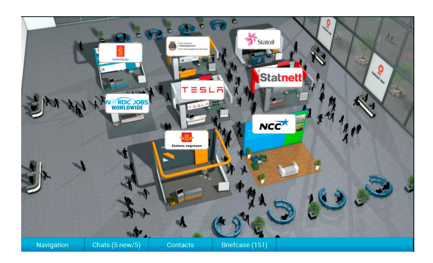
Figure 2. Representation of virtual booths at a career fair (picture courtesy of Global Forums).

Figure 2 outlines the benefits of virtual fairs in terms of location. As the virtual venue can be tailor-made, no exhibitors or recruiters are potentially disadvantaged by being located in a location less likely to be reached by job seekers.