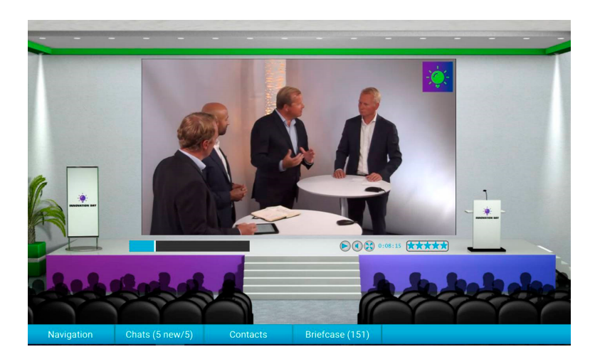
Figure 3. Example of a discussion between stakeholders.

Figure 3 on the next page demonstrates the ease with which talks and conference presentations can be incorporated into virtual fairs, allowing recruiters and exhibitors to invite potential job seekers to their events.