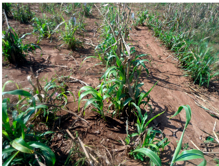
Figure 1. Post-harvest regrowth in a perennial sorghum trial at Serere, Uganda, 2015.

Starting in 2014–2015, many F_1 and F_2 plants with phenotypes very different from those observed in previous years began appearing in TLI nurseries. In previous experience, all F_1 hybrids and F_2 populations from annual \times perennial Sorghum crosses had phenotypes more similar to the perennial parent than to the S. bicolor parent: more profuse tillering and branching, longer panicle branches, thinner culms, greater height, smaller seed, and more tenacious glumes. In contrast, the new, anomalous hybrid plants (comprising 129 of the 165 interploidy hybrids produced in 2013) were closer in phenotype to S. bicolor . Further investigation showed that all of the 129 anomalous hybrids were not tetraploid as would be expected, but were in fact diploid [23]. Only a single such diploid product of diploid \times tetraploid Sorghum hybridization had been reported previously [24]. The timing and mechanism of chromosome elimination that leads to such hybrids is still under investigation; nevertheless, if perennial diploid plants can be selected from S. bicolor n \times S. halepense populations, complications of interploid hybridization and tetraploid segregation can be avoided, thereby streamlining perennial sorghum development.