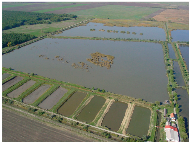
Figure 5. View of the pond recirculation system of Jászakiséri Halas Ltd. (Jászakisér, Hungary).

The commercial application of recirculation pond technology on the increase nowadays, and currently three intensive fish farms in Hungary produce European catfish and African catfish.