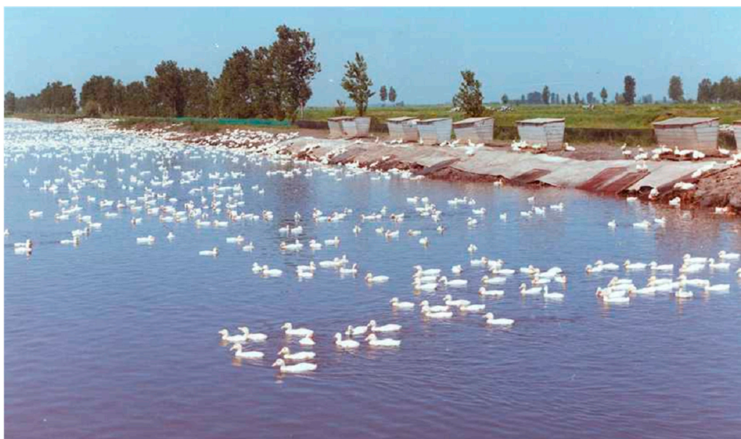
Figure 2. Large-scale duck raising on fish ponds.

Feeding above the surface of the water had the advantage that fish could utilize the spilled feed. If ducks were kept on the dykes of embankment ponds, their footfall quickly damaged the dykes. In order to avoid this damage, the dyke sections where ducks were kept were frequently rotated or protected by covering the soil with plastic nets. The most favorable option was keeping the ducks on the shores of barrage ponds.