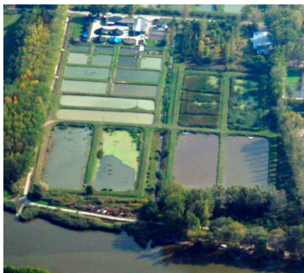
Figure 4. Combination of an intensive fish farm with extensive ponds and wetland (the intensive farm can be seen on the top, the water treatment unit consisting of two 0.5 ha fish ponds and two 0.5 ha wetlands are in the center). (Photo by courtesy of HAKI).

30% common carp, 5% grass carp) is recommended. Fish yields of 2–3 t/ha can be achieved on the ponds without feeding.