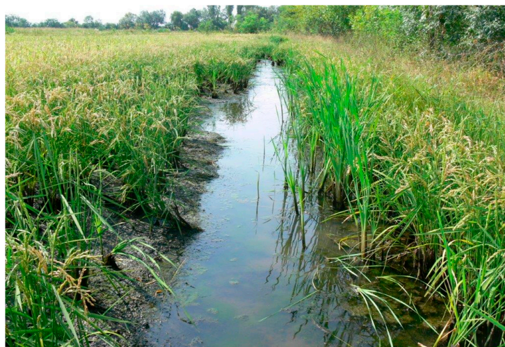
Figure 1. Organic rice production is assisted by fish stocking in rice paddies in Hungary.

The fish generally stayed among the rice, in nutrient-rich, shady areas. Massive migration to the open trenches—where the water was too warm because of the lack of a shade-providing plant cover and where birds could easily see the fish—occurred only during the draining of the paddies. Losses to smaller fish were caused by aquatic insects, frogs and smaller aquatic birds (marsh terns and gulls), while bigger fish were mainly preyed upon by night herons and grey herons. The unused surface of rice paddies, occupied partly by bunds, and partly by trenches for the fish, made up about 10% of the total area. If the farms were situated close to each other, a qualified fishing master and a fisherman were employed for an area of 200 ha. The method of fish-cum-rice production is still practiced in Hungary during organic (chemical-free) rice growing [40]. Rice paddy preparation is done with laser-controlled machines in order to ensure a bottom slightly sloping toward the outlet. Trenches deeper than usual (30 cm) and bottom drains are constructed so that this ditch system slopes towards the outlet (Figure 1).