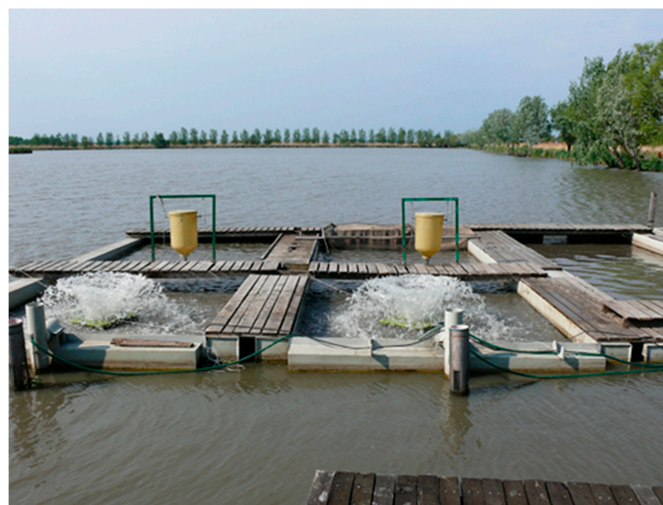
Figure 6. Intensive flow-through fish production unit installed within an extensive pond.