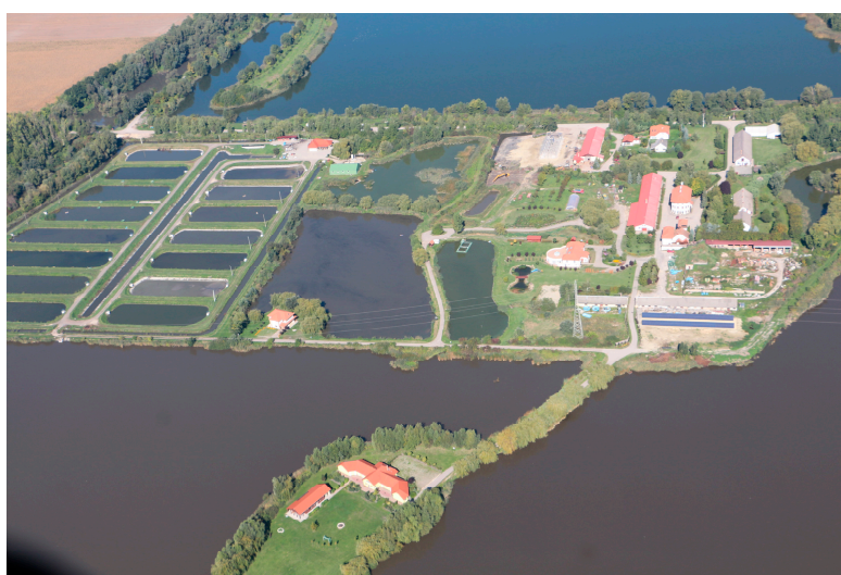
Figure 7. Schematic view of an MFPF in Hungary (by the courtesy of Aranypony JSC. Rétimajor, Sáregres, Hungary).

Multifunctional pond farming (MFPF) differs from traditional pond farming in that the activities performed in a multifunctional pond farm are much broader and are not limited to the production of aquatic and terrestrial organisms (animals and plants), but also include the cultivation of non-food products, as well as ecological and societal services (Figure 7). MFPF is a special type of IMTA, aiming not only at the utilization of a certain water body, but a complex wetland system. The basic component of the wetland is the fish pond; however, the system also includes the fishpond's natural and constructed environment. Practical results prove that MFPF provides a higher and more secure income to farmers through diversification and complex utilization of resources, while contributing to maintaining and increasing biodiversity, improving our knowledge of nature, as well as encouraging the social acceptance of fisheries.