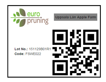
Figure 3. Example of printed label as integrated in the TS. It indicates a printed label for a biomass product with lot number 151129B01R1, label code of a farmer from Sweden: FSWE022, from a farm randomly named as Uppsala Lan Apple Farm in Sweden.

On this label, it is mandatory to show the logo and the code (label number) of the producer or that of the registered trader (handling the product). Still, the complete identification with all codes from every step can be embedded in the QR code. Accordingly, the company name (label holder), lot number, label number (code with four letters and three-digit numbers) assigned to the label holder, and QR code will be indicated on the label (see Figure 3 and Table 3).