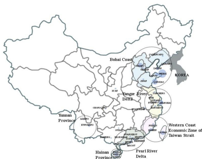
Figure 1. Map of generating and destination regions.

The Chinese golf destinations were divided into seven regions (Figure 1) according to their characteristics: Bohai Coast; Hainan Province; Pearl River Delta; Western Coast Economic Zone on the Taiwan Strait; Yangtze River Delta; Yunnan Province; and other [8,73]. The selected destinations attract Korean golf tourists in different ways based on their resources, including geographical, cultural, and other factors. The Chinese literature and in-depth interviews with Korean golf travel agencies support the geographic classification for this research, but this grouping also needs to be verified by tourists’ descriptions of the regions. Supply-side sources provide information on the quality and quantity of golf courses, geographical proximity, and climatic advantages, but tourists’ narratives may reveal important social and cultural criteria for destination classification.