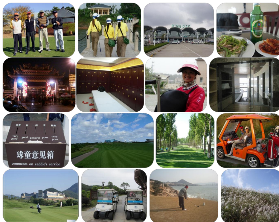
Figure 3. Photographic examples of blog contents.

The photographs which were taken and posted represent the tourists' 'gaze' in a visual objectified form. As exemplified in Figure 3, the gaze of the Korean golfers mainly involved three dimensions of headwords: the environment and facilities at the golf courses; tourism attractions; and human elements. The objects with the highest frequencies in the photographs were club houses (155), hotels (69), carts (95), fairways (447), grass (137), courses (156), paths (95), sea (179), lakes (139), woods (143), trees (75), landscape (133) and food (59); city tours (93); and golf partners (196) and caddies (56). The photographs were coded into only 51 of the 136 headwords. This was because no photos directly represented the other headwords, such as climate, transit time, and so forth. Therefore, the photographs concentrated on more specific and less diversified objects than the blog text in describing tourists' experiences.