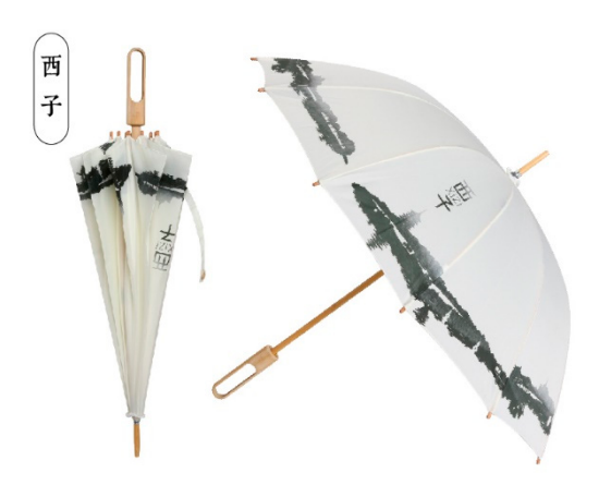
Image 8. Zhuyu umbrella inspired by silk umbrella with Bamboo structure, awarded IF prize, Red dot prize. http://www.ulibuy.com/productinfo.html?seqid=69409.

the of manual input. According to a designer involved in this project, there is a move to employ auto-machines or technologies to improve the making process and increase efficiency, so as to reduce the cost. If this is achieved, aside from the bamboo material, what can be recognized as a form of ICH that conveys the craftsmanship and local culture of silk umbrella? Although the original purpose was to revitalize ICH crafts, the umbrellas are now mass-produced. The umbrellas are sold at the price of approximately 300 yuan. However, the use of bamboo structure is unique and greatly reduces the environmental impact. Therefore, compared to other mass-produced umbrellas in the Chinese market, these are more popular despite being more expensive.