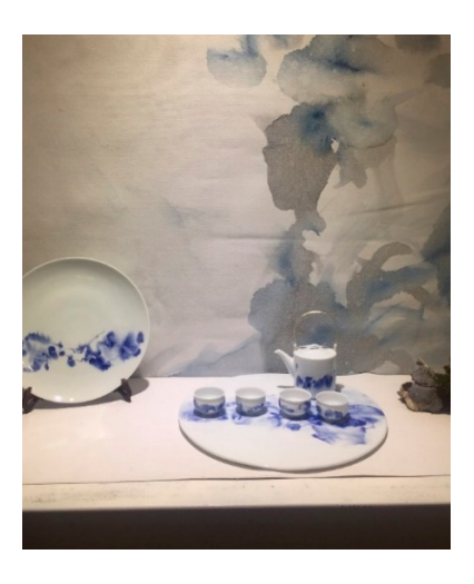
Image 4. Artist Gan Gaopu's modern blue and white porcelain tea set.

culture through their forms and techniques or in the ways they are used. The tea plate and saucers in have the design and style of traditional vessels while being forged by the Master's new technique of melting-cooling-crystalizing. These modern, and also traditional craftworks are welcomed among the rising Chinese middle-class.