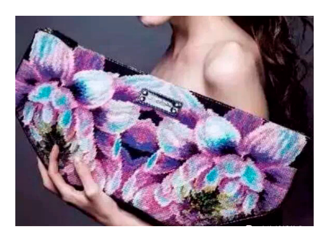
Image 7. New product by using the ICH technique of Shanghai Woollen Needle Tapestry.

As Image 7 shows, these products are difficult to clean and keep because of the woollen material. When asked if he had considered changing the directions of current designs, product use or target consumers or markets, Mr Bao replied,