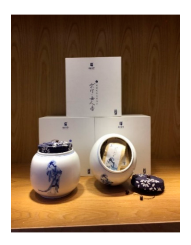
Image 6. Tea leaves pots redesigned and branded "Story of Blue and White" in Jingdezhen.

Regarding the outlet for his products, Mr Bao was running two sales models, developing new products for Taobao online sale and also for the relatively high-end physical stores in shopping malls. According to him, sales were still not good.