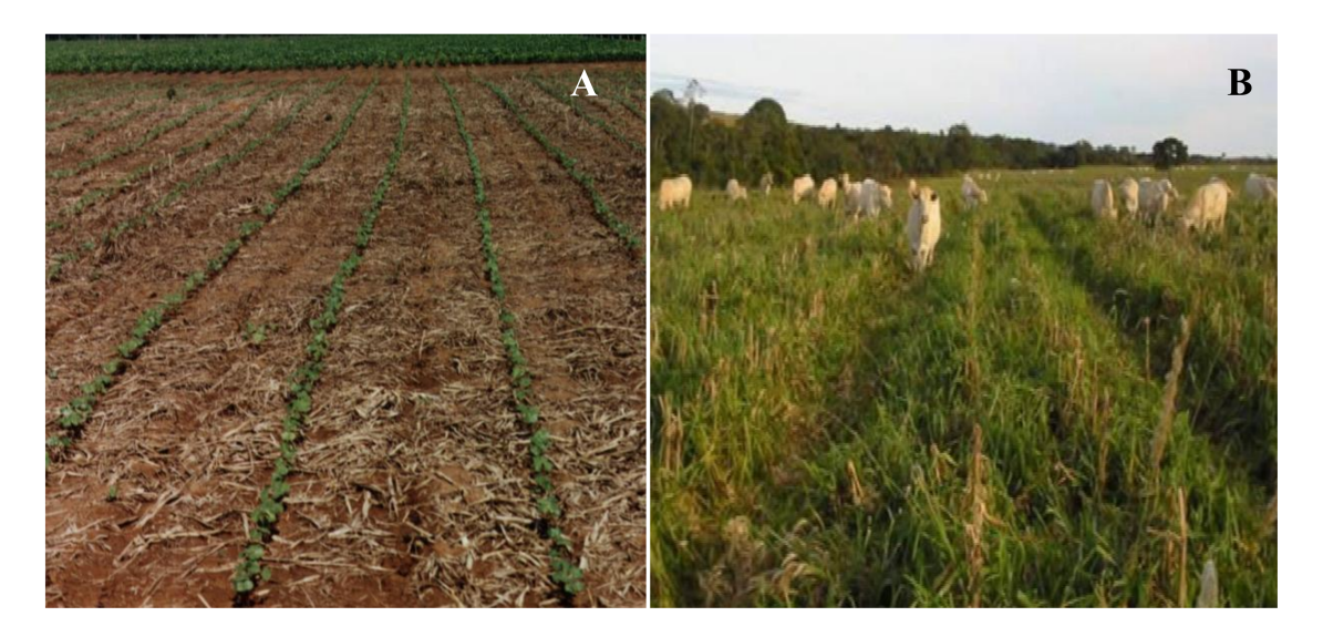
Figure 3. Examples of best management practices in Rondônia and Mato Grosso states, Brazil. (A) No-tillage (NT) system in commercial farm in Rondônia; (B) Integrated crop-livestock system in Mato Grosso with sorghum- Brachiaria grass intercropping.

The data presented in this report also show that the adoption of BMPs on cleared lands can offset a part of the C emissions (Figure 3). However, to meet growing food demands and advance global food insecurity, it is necessary not only to increase agronomic productivity from the exiting agroecosystems but also to better understand how and in which biomes new land can be brought under agricultural production. Therefore, comparative scenarios of BMPs for the Amazon forest and Cerrado in Rondônia and Mato Grosso states were assessed (Table 3).