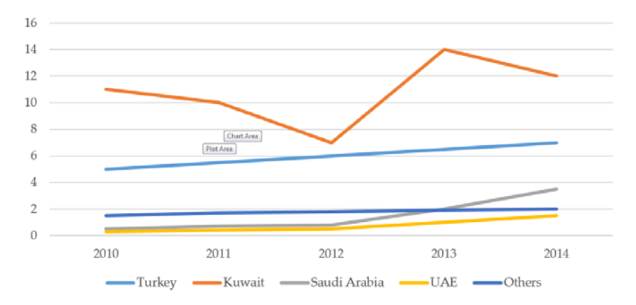
Figure 3. Hellim/halloumi export countries (million US dollars).

is consumed in the domestic market. According to the Cyprus Turkish Chamber of Industry [29], in Northern Cyprus, people consumer around 12 kg of hellim/halloumi per capita in a year, which is more than any type of imported cheese, showing the importance of this traditional product in consumers' choices.