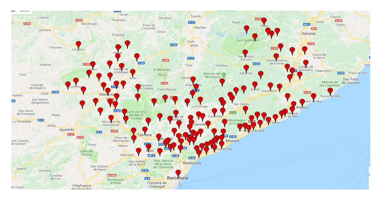
Figure 2. Map displaying the municipalities where the landrace mongeta del ganxet ( Phaseolus vulgaris ) is cultivated.

Finally, to assess whether CONECT-e can protect TAeK on landraces from enclosure, we used literature review, desktop research, and informal conversations (face-to-face and via mail) with members of the RdS to identify which landraces documented in CONECT-e have suffered from enclosure issues. The three authors who are members of the RdS reviewed all the landraces documented and noted those that could have experienced enclosure. We then gathered information through informal conversations with members of the RdS and grey literature (i.e., press release, reports, and articles) to catalog the landraces threatened and characterized the enclosure's processes.