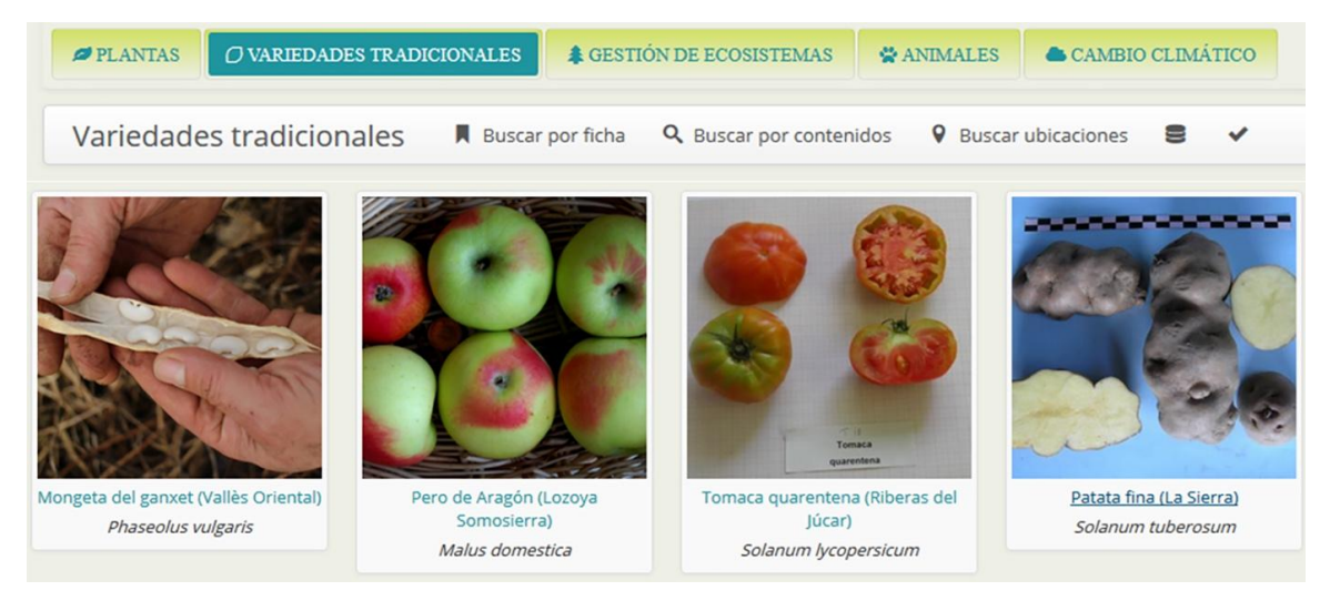
Figure 1. Landraces photographs at CONECT-e's front-page.