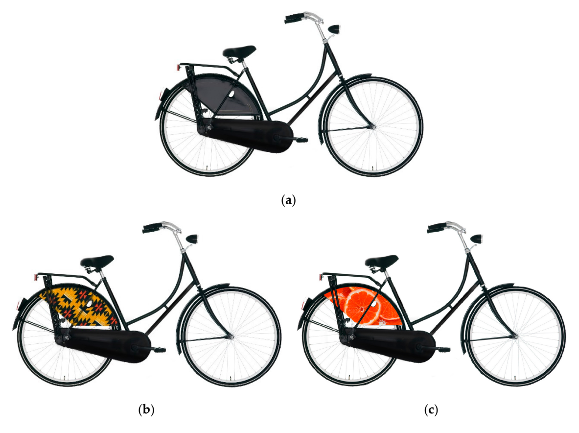
Figure 1. The three stimuli. Top ( a ): typical bike, bottom ( b , c ): typical bikes with personalised coat guards, pattern and grapefruit.