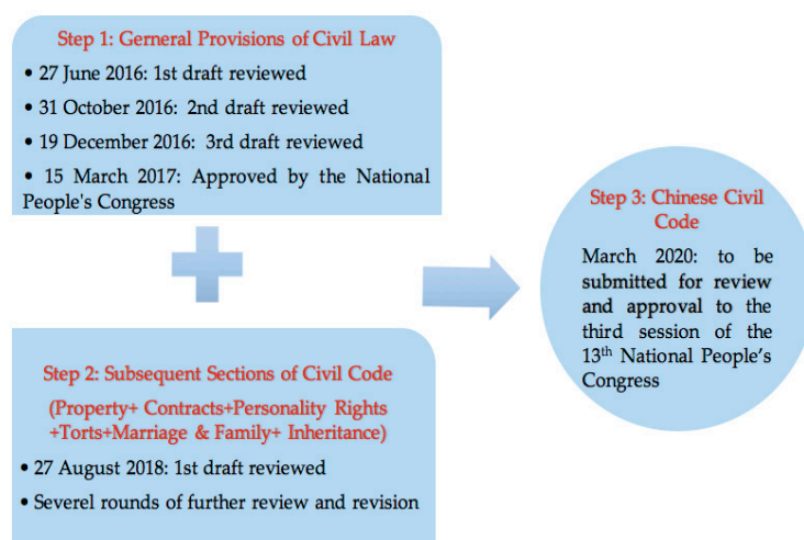
Figure 1. Timeline of Chinese Civil Law Codification.

According to the legislative plan, civil law codification is a three-step process. The first step is to formulate the General Provisions of Civil Law and submit it to the NPC for review and approval in March 2017. The second step is to formulate subsequent sections of the civil code under the guidance of the General Provisions of Civil Law and submit them for review to the Standing Committee of the NPC. The third step is to combine the subsequent sections with the already passed General Provisions of Civil Law into a draft of the civil code and submit it for review and approval to the third session of the 13th National People's Congress to be held in March 2020 (see Figure 1).