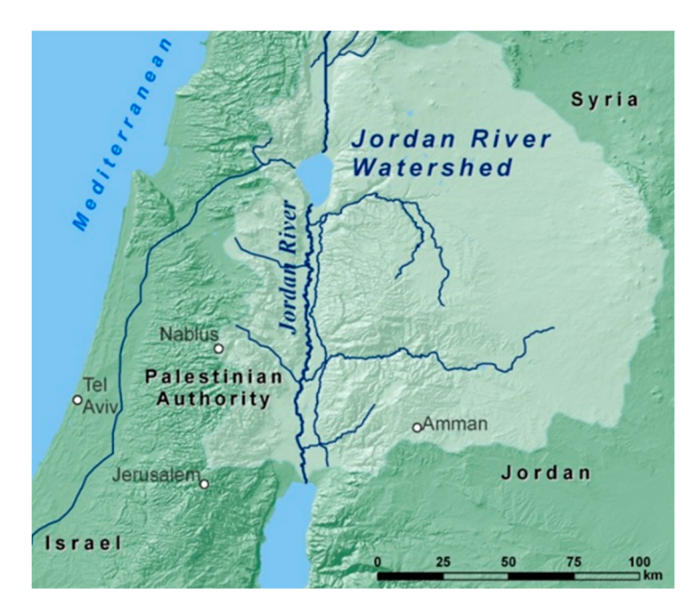
Figure 1. Location map of the Jordan River Region.