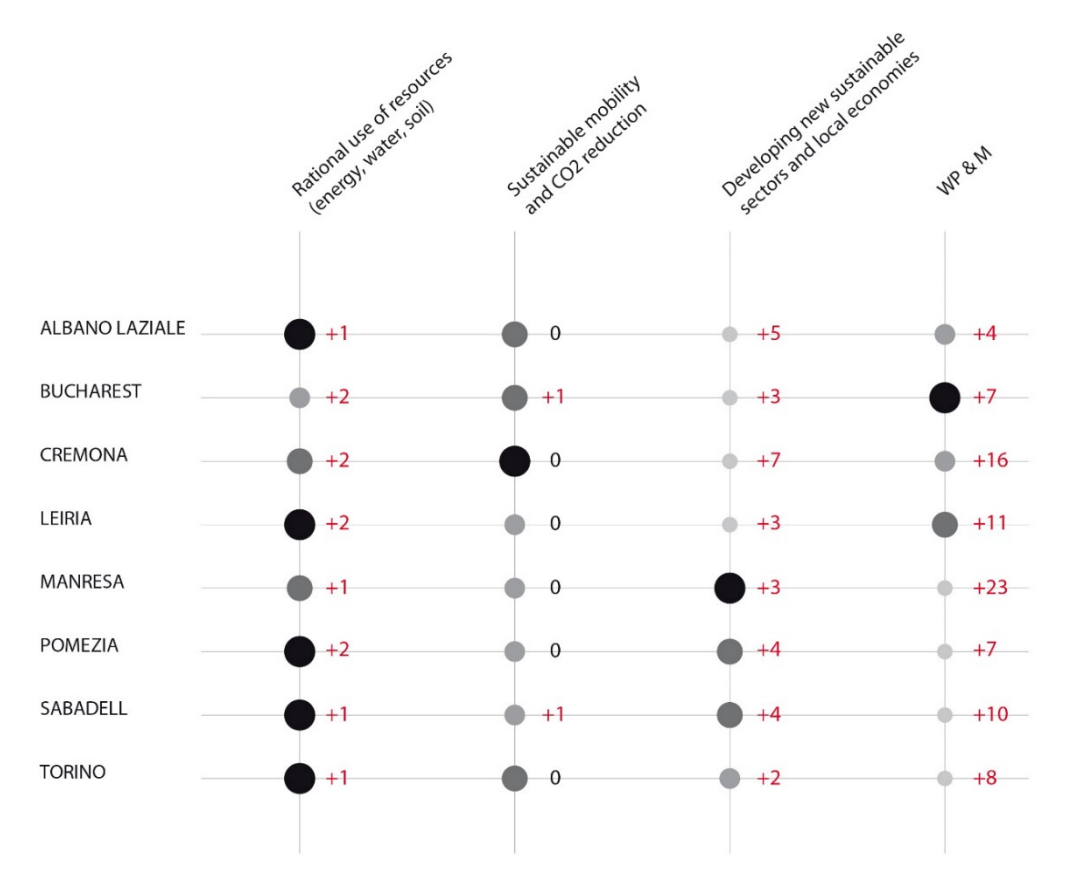
Figure 3. Classification of (i) the existing measures implemented or allocated within the current policies in the eight pilot cities that have an effect on resource consumption and waste production, and (ii) the new planned measures defined within the strategic plans, according to the four main categories identified: rational use of resources—energy, soil, and water; sustainable mobility and CO<sub>2</sub> reduction; development of new sustainable sectors and local economies; and waste prevention and management. Circles represent an approximate proportion of the existing measures classified by the four categories. The bigger and darker is the circle, the greater is the number of the existing measures related to that category. Alongside the circles, numbers represent the number (as an increased quantity) of the new planned measures defined within the strategic plans.

Figure 3 shows, for each one of the pilot cities, both the existing measures implemented or allocated within the current policies (see also Table 1) and the new planned measures defined within the eight strategic plans. This allows a visual and immediate comparison of the relevance (in terms of magnitude and number) between the existing and the new planned measures and actions. It helps to understand how (i.e., in which sectors and with which relevance) the strategic plans developed within the Urban_WINS project could contribute/reinforce the city strategy on waste prevention and resource management.