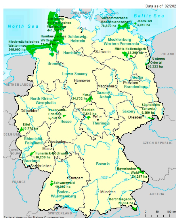
Figure 1. German national parks (Source: Bundesamt für Naturschutz (BfN), 2019, according to the basic geodata of the federal states: © GeoBasis-DE/BKG 2018 https://www.bfn.de/en/activities/protected-areas/national-parks.html , accessed 30 June 2020).

The first German national park (Bavarian Forest) was established late, in 1970. In 2005, when the evaluation process was started, 14 national parks existed in Germany. In 2014 (Black Forest) and 2015 (Hunsrück-Hochwald), two more national parks were established and the discussion on the foundation of further national parks is still ongoing [15,16]. Figure 1 provides an overview of the parks' geographic distribution. They include different landscape and ecosystem types: the Wadden Sea and coastal areas, lake areas and river floodplains, high mountain ranges in the alps and different types of forests, e.g., beech forests which are partly designated as UNESCO World Natural Heritage (Figure 2). The 16 national parks cover a total area of 1,047,859 ha, including marine areas; and 205,655 ha excluding marine areas. Their size differs substantially, ranging from 3070 ha (Jasmund) to 441,500 ha (Wadden Sea Schleswig-Holstein). The size of the national parks without marine areas is between 5738 ha (Kellerwald-Edersee) and 32,200 ha (Müritz). All but three of the parks reach the minimum size of 10,000 ha, as suggested by the quality set for German national parks [11,12]. For further information, see https://www.bfn.de/themen/gebietsschutz-grossschutzgebiete/nationalparke.html .