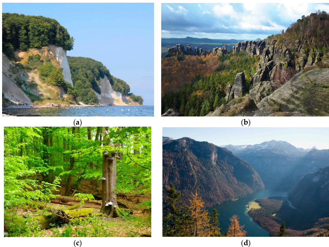
Figure 2. Impressions from German national parks: (a) Jasmund, chalk cliffs at the Isle of Rügen in the Baltic Sea; (b) Saxon Switzerland, sand stone erosion landscape; (c) Hainich, Thuringia, also designated as UNESCO World Natural Heritage site for its beech forests; (d) Berchtesgaden in the Bavarian Alps, view to Königssee in the management zone, a popular tourist destination. (Photos: a–c: Nationale Naturlandschaften e.V., K. Sabry, A. May, S. Schubert; d: M. Günther).

German national parks are managed in line with the IUCN’s requirements for protected areas’ management category II [17], although many of them do not yet meet all the requirements of this category. This concerns, in particular, the minimum proportion of 75% of the entire park, which must be dedicated to dynamic natural processes without human interference or land use (“nature dynamics zone”, often also named “core zone” or “nature zone”). Since Germany’s national parks are regarded as “development national parks” [18], they have to achieve this percentage only 30 years after their establishment. Moreover, this figure is not laid down in the German Federal Nature Conservation Act, which requires a nature dynamics zone proportion of at least 50% of the total park area, and the nature conservation laws of the individual federal states. However, the 75% target is explicitly mentioned in some national park acts and/or ordinances and also included in the evaluation quality set [11,12,14].