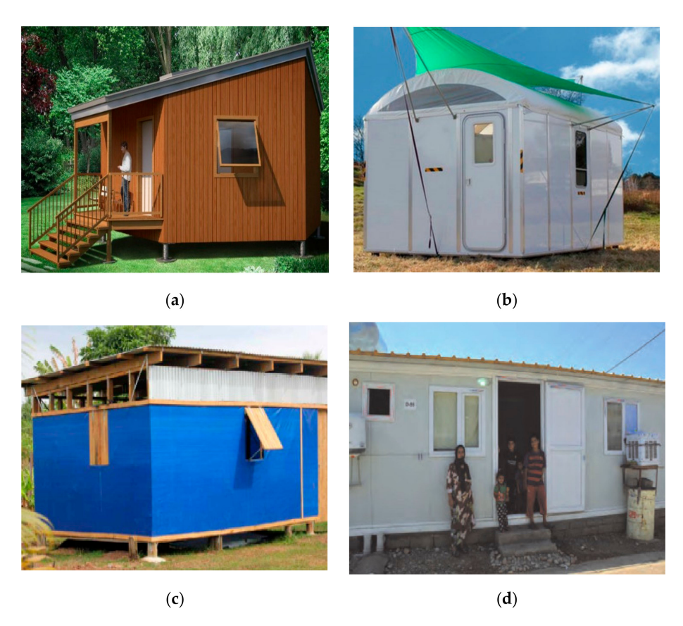
Figure 3. Shelters with economical inadequacy: (a) Hex House shelter [69], (b) Rapid Deployment Module, photo courtesy of RDM and Fast Company [65], (c) Fiji 2012 transitional shelter, photo by Habitat for Humanity Fiji [81], (d) Iraq 2015–2016 transitional shelter, photo by Alan Miran [27].

About 83% of the 'novel designs' analysed, have costs that are significantly higher than the 'existing solutions' or with unknown cost. Figure 3a shows the Hex House, a shelter designed by Architects for Society. In the Dezeen online magazine, the cost per unit was denoted as $15,000–$20,000 [70], while in the Hex House website, it is shown as $55,000–$60,000 [69]. Another novel shelter design with a high cost is the Rapid Deployment Module (Figure 3b) [65], with unit costs around $15,000–$18,000 [64]. On the contrary, 67% of the 'existing solutions' had modest costs (equal to or less than $1300). However, there were cases with costs that are considered high compared to other shelters such as Fiji 2012, which is shown in Figure 3c. Its material costs were $1800 and the overall project cost per shelter was $2900. The main reason for its high cost is likely to be Fiji's remote location, which increased the materials' transportation cost and therefore the overall cost [81]. Another 'existing solution' with a high cost is the Iraq 2015–2016 transitional shelter shown in Figure 3d. The shelter had material costs of $5500 and a project cost per household of $9621. The initial costs for establishing the sites were high and the political situation and the higher shelter standards also contributed to the high cost [27].