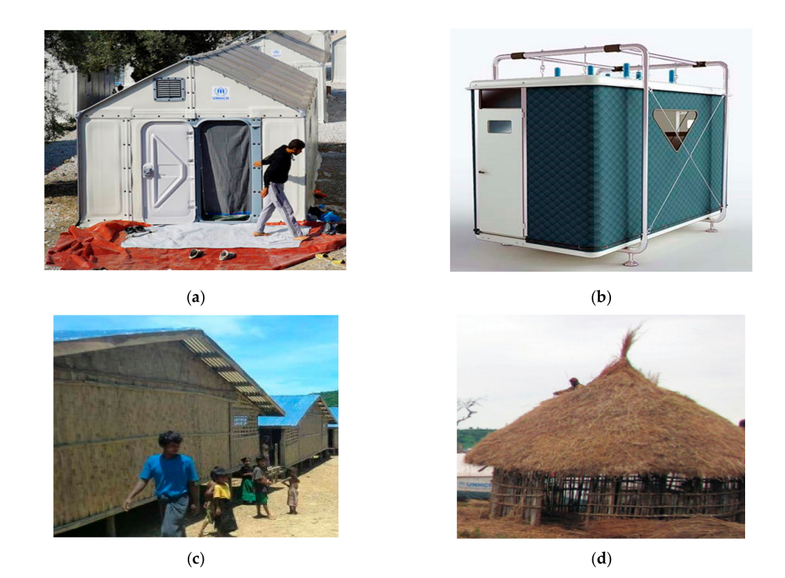
Figure 1. Shelters with social inadequacy: (a) Refugee Housing Unit [78], (b) Tentative Concept post-disaster shelter [67], (c) Myanmar 2012 temporary collective shelter [81], (d) Ethiopia 2011 semi-permanent shelter [20].

Other common cons were the total dependency on the availability of local materials in the location or total dependency on global materials, and proposing short-term solutions. Building collective shelters instead of private shelters was also apparent in the 'existing solutions' such as the Myanmar 2012 shelter that hosts eight families (Figure 1c) [81]. Providing a shelter design that is familiar to the host community but not to the users is another issue that was highlighted in the case of Ethiopia 2011. The Tukul shelters that were given to the refugees were familiar in the Ethiopian culture but not for the Sudanese who lived in them (Figure 1d). In the same case, another social inadequacy appeared when there was no space to shelter the livestock brought by the Sudanese refugees from their homeland [76]. Recent evidence has also shown that elements of social sustainability should go beyond the human sphere and take into account livestock and domestic animals because of their important role in certain cultures [82].