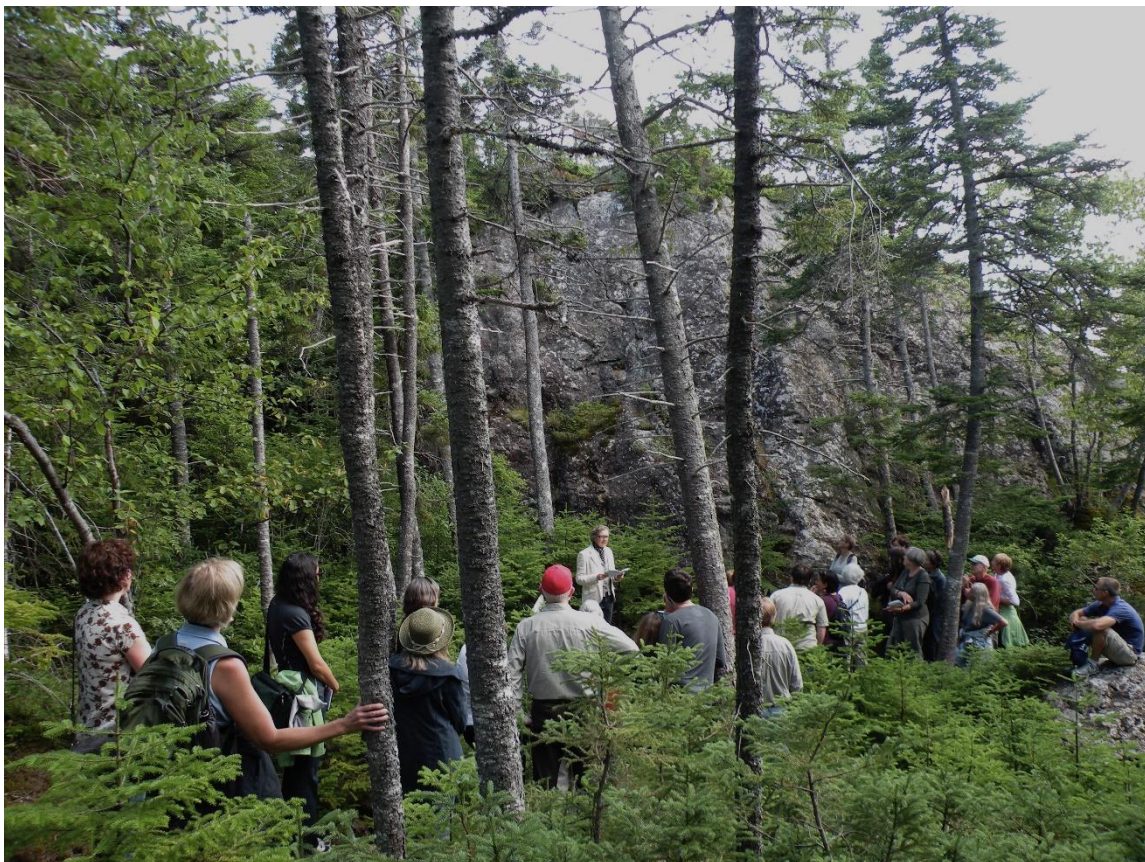
Figure 7. Marlene Creates reading site-specific poetry in The Boreal Poetry Garden for the UN International Year of Forests, 4 September 2011.