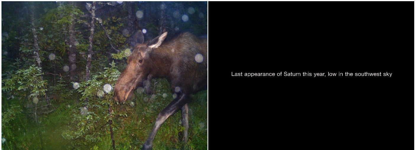
Figure 6. Marlene Creates, 15 September 2015 from the series What Came to Light at Blast Hole Pond River, Newfoundland 2015 (and ongoing) . Colour photograph and text, digital pigment print, 24 × 66 inches/61 × 168 cm.

As a means to make the project accessible beyond Portugal Cove, Creates built an interactive online project in 2010 (in collaboration with videographer Elizabeth Zetlin and web designer Jedediah Baker) that invites the virtual visitor to tour the forest and listen to Creates recite fifteen poems. Derek Gladwin describes the virtual interface in a recent essay: