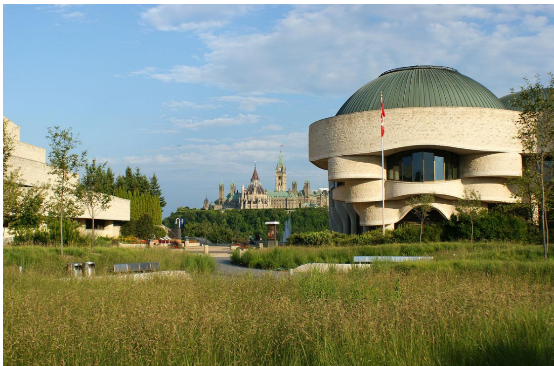
Figure 4. Claude Cormier et Associés, Canadian Museum of Civilization Plaza/Esplanade du Musée canadien de l’histoire, Gatineau (Quebec), Canada. Landscape design, 2011.

I turn now to the Urban Prairie at the (then) Canadian Museum of Civilization (CMC), today the Canadian Museum of History, in Gatineau, Québec (Figure 4). This human-designed landscape project is tiny compared to the vast landscape of the Farnham Glacier, and it has no dramatic public narrative in the way that the glacier did. Designed by landscape architects Claude Cormier + Associés in Gatineau in 2005 and opened to the public in 2010, the Urban Prairie is a human-made miniature landscape that aims to evoke the undulating topography and grassy flora of the Canadian prairie. This small landscape responds to the two major architectural features found on this important site: the curatorial and the exhibition wings of the Canadian Museum of Civilization, designed in 1989 by Indigenous architect Douglas Cardinal [32].