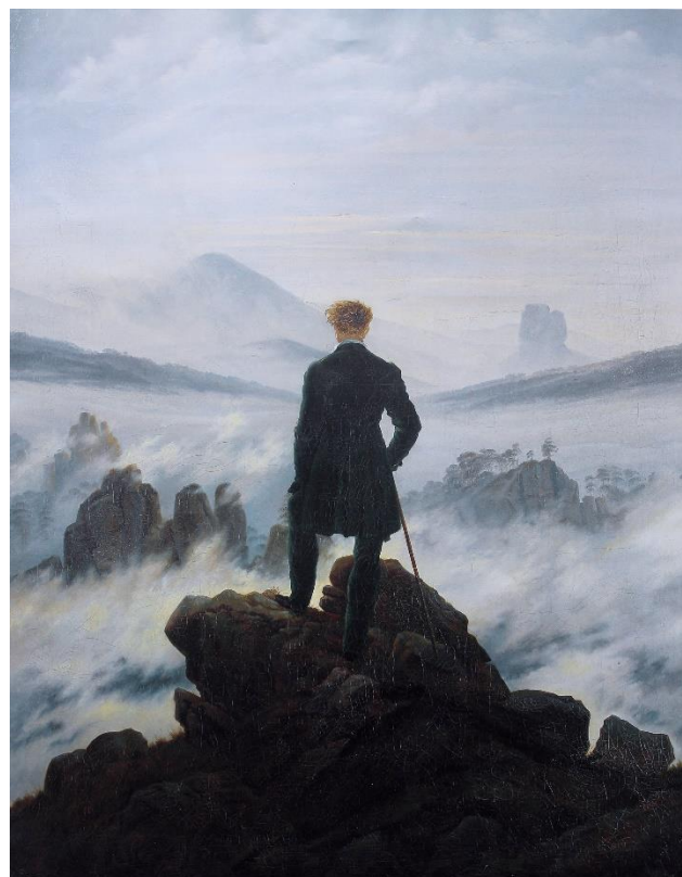
Figure 2. Caspar David Friedrich, Wanderer above the Sea of Fog , 1818. Oil on canvas. Image in the public domain.