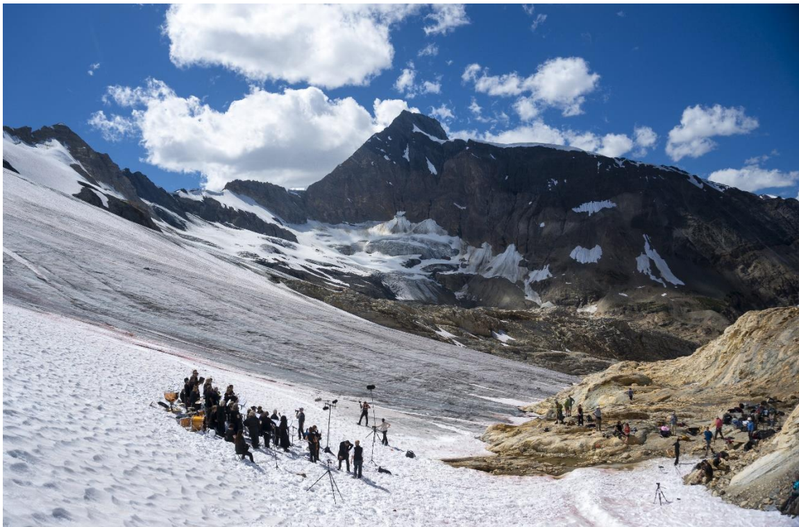
Figure 1. Paul Walde, Requiem for a Glacier (site-specific performance), July 2013.