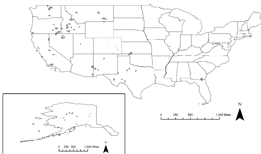
Figure 1. US Megafire Perimeters, 2010–2017.

Data on all US megafire locations over 2010–2017 were obtained from the USGS Geospatial Multi-Agency Coordination (GeoMAC) system. The GeoMAC system is the most complete accounting of US wildfire perimeters and was originally designed to give fire managers near real time fire perimeter information on any US wildfire that was known to the National Interagency Fire Center. In addition to perimeter data, GeoMAC also provides information on the acres burned, the name or designation of the fire, and event narratives. Observations for megafires—i.e., fires whose final perimeter size was >100,000 acres—were retained for further processing. Using GIS software, we then calculated all instances of any >0% megafire perimeter overlap with each county, using data on the final megafire extent. Each county was then assigned information on the characteristics of each megafire that physically burned within its boundaries at some point during the fire event, including information on the date of fire overlap and the total acres burned by the fire. Megafires that spanned more than one county are included in the analysis and the affected counties are appropriately coded as experiencing a fire event. Figure 1 shows the final perimeters for all US megafires between 2010–2017. Most megafires occur in the western US.