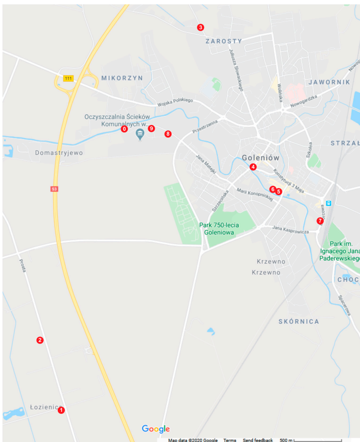
Figure S1. Map of the location of the sampling sites in Poland.