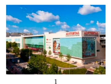
Alstertal Einkaufszentrum, Hamburg Germany | 2020 | DGNB | Platinum