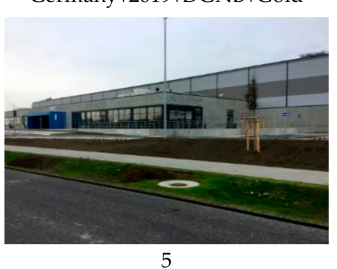
May Sortation Center Kiekebusch Germany 2020 DGNB Platinum