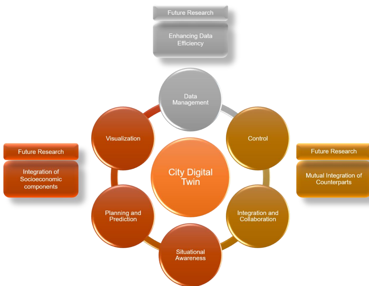
Figure 3. Advancement of the city digital twin's potentials.

The proposed future research directions are intended to widen the potentials of the city digital twin by adding another theme that will need further research, which is the ability to control the physical side of the city via the digital model (Figure 3). Besides, going forward with this research agenda is anticipated to enhance the current potentials of the city digital twin towards achieving the development of a wholly mirrored city digital twin, especially if the research addresses the city digital twin as a whole, and so, the interrelationships between its potentials can be realized, and a more holistic view of its contribution to the enhancement of the city's operability and management can be achieved.