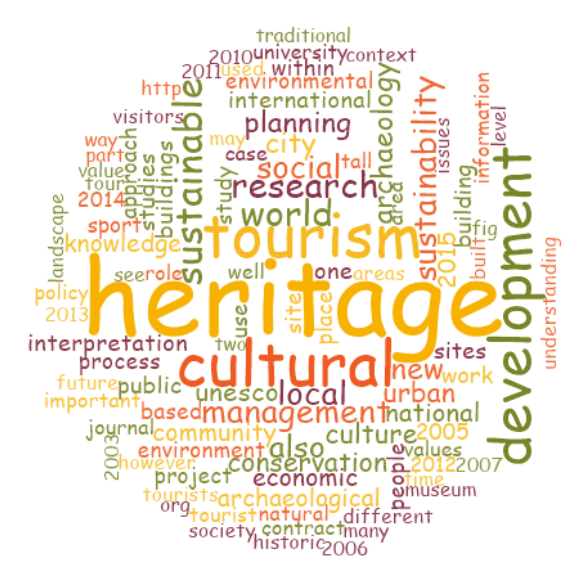
Figure 1. Tag cloud-the most common words in the analysed abstracts.

In the first step of the analysis, a text mining analysis of abstracts of the researched articles and books was performed. In this way, the most common words in the abstracts of the researched sources, consisting of at least three letters, were identified. A tag cloud was generated from these words using NVivo 11 package (Figure 1). Cloud analysis shows that the most common words in the sources studied are: heritage, cultural, tourism, development, sustainable and research. Frequently appearing words include: sustainability, planning, local, management and interpretation process, which indicates that the collected documents concern the formulated research problem.