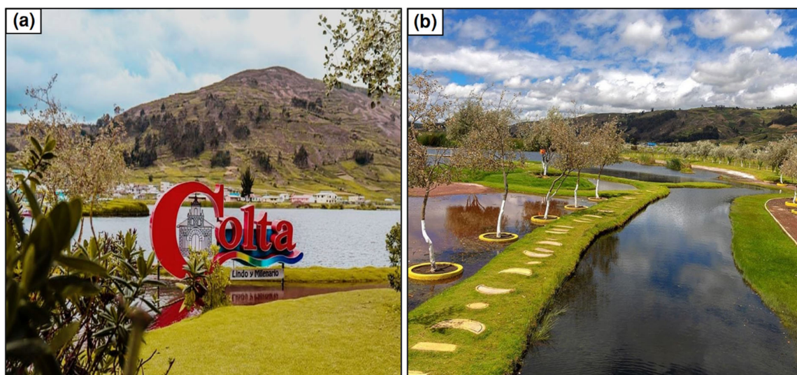
Figure S1. One of the most visited geosites in the province of Chimborazo: (a) “Colta” lagoon front landscape; (b) Side landscape.