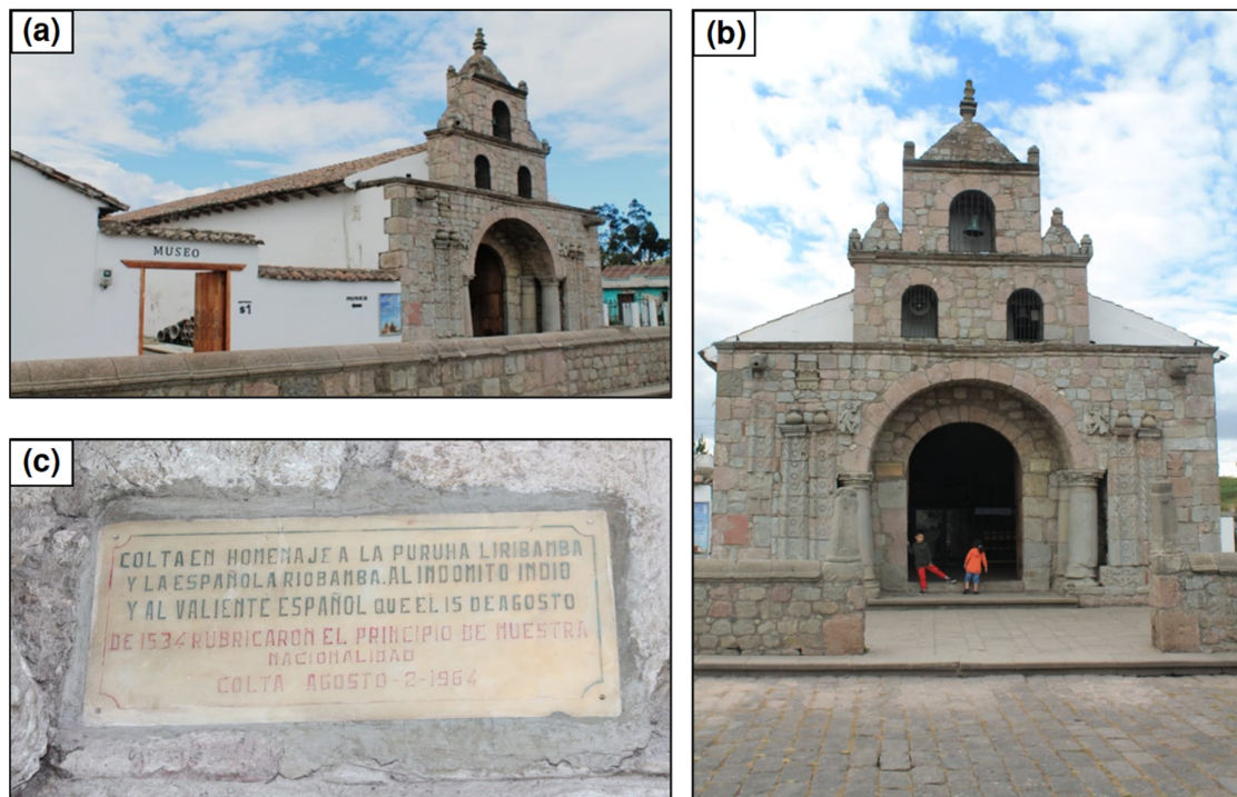
Figure S3. Representative site of the Chimborazo province: (a) Lateral part of the "Iglesia Balbanera"; (b) Relic of the church; (c) Front and striking part of the church.