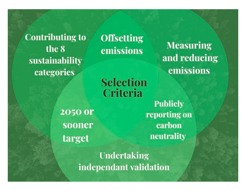
Figure 1. Selection criteria used for identifying the case study universities.

In the Stage 2 of this review, the initially identified list of 15 universities was further narrowed down to select 'case study universities' which were potentially making significant progress towards achieving carbon neutrality. The case study universities were identified based on their performance in the above-listed eight sustainability criteria and their strong commitment to achieving carbon neutrality. Another criterion for selecting the case study universities was based on the Climate Active Neutral Standard and whether the universities are taking steps to achieve that certification. Based on these criteria, six "case study universities" in Australia were identified in Stage 2: the University of Tasmania (UTAS), Charles Sturt University, the University of Melbourne, the University of New South Wales (UNSW), Monash University, and RMIT University. As mentioned earlier, thus far only Charles Sturt University and UTAS have been certified as carbon neutral in Australia. While most universities have a net zero aim of 2050 or sooner, the six universities chosen as case study universities have demonstrated greater commitment and progress in their sustainability programmes and ambitions to achieve carbon neutrality. The criteria considered for selecting the case study universities are summarised in Figure 1.