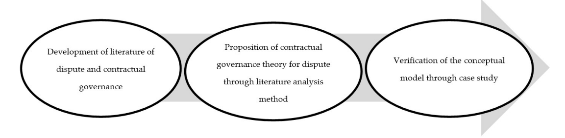
Figure 1. General methodology of this research.

The research idea of this manuscript includes proposing a framework of GS, GM and a conceptual model through a literature analysis method that is widely used at home and abroad [77].Contract clauses, which are the main form of contract, define rights and obligations of each party. GSs for disputes are relatively explicit in clauses compared to clauses related to GMs. It is noted that GM study is much more difficult than GS study [68]. The MICS method was adopted to study the GS and GM by analyzing and comparing clauses of contracts. The conceptual model was verified based on cases provided for contract drafters. The methodology of this research is shown in Figure 1.