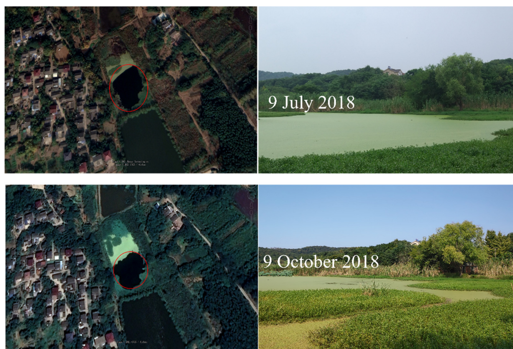
Figure 1. Spread of Alternanthera philoxeroides Griseb in eutrophic wetland. Photos were taken in a eutrophic pool invaded by A. philoxeroides Griseb next to Huilong reservoir, Zhenjiang City, Jiangsu Province, China (119°45' E; 32°15' N) in 2018. These pictures show spread of A. philoxeroides Griseb over 3 months (9 July to 9 October 2018).

The competitive performance of invasive alien plants is often habitat dependent [11]. That is to say, resource availability in the habitat is a critical factor determining community susceptibility to alien plant invasion. It also determines the ability of alien plants to invade a particular habitat [12]. Among various factors, the coupling effect of N and P dictates the success of alien species invasion [13]. High N and P contents may promote invasion rather than being a consequence of invasion [14]. There is a positive and synergetic effect of N and P on the invasiveness of opportunistic alien species (Figure 1) [4].