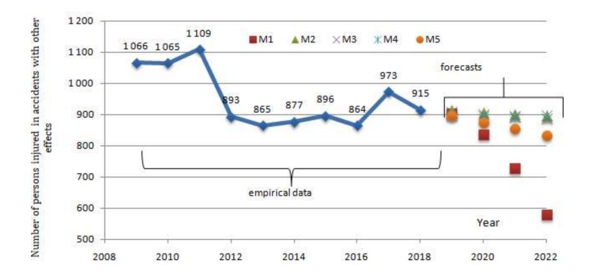
Figure 2. The number of persons injured in other accidents in the steel sector in Poland, with regard to forecasts produced on the basis of Holt's models, M1–M5 (own elaboration).

The developed forecasting models allow for the conclusion that the number of persons injured in other accidents shows a downward trend, which is a positive forecast for the steel industry in Poland (Figure 2). In connection with the above, measures should be taken to improve occupational safety, ensuring that the forecast trend for the number of persons injured in other accidents (so-called minor accidents) is maintained.