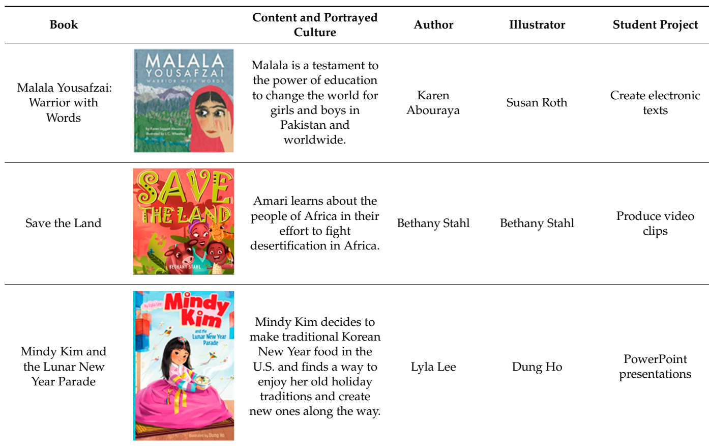
Table 1. Student-selected global literary texts.

During their course studies, the native English-speaking teachers became more knowledgeable about global literary texts, and the researcher invited them to build a reading list for the Korean students. The teachers chose English illustrative texts that portrayed global cultures beyond that of the United States. They were conscious of the fact that a single book could distort the students' outlook on culture; however, the reading list served as an invitation for further reading about a specific culture. The researcher also requested the Korean students to recommend a list of global literary texts; however, the students had little knowledge of such texts and were unable to find any interesting texts in English. Therefore, the Korean students chose four texts from the suggested reading list (Table 1).