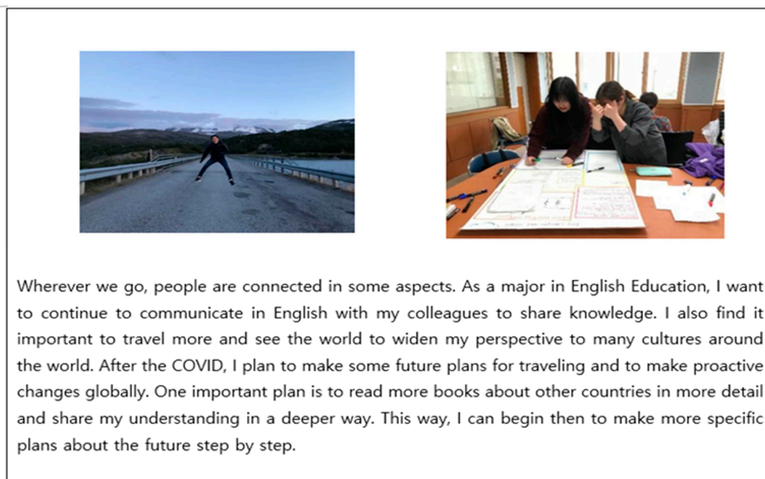
Figure 1. Example of student writing.

The students noted that such opportunities assisted in their writing practices. They performed freewriting and reshaped their writing in their electronic texts and power point presentations. They made use of the four illustrative texts as mentor texts; for example, they created electronic texts about female activists such as Malala. One student, Boyoung, used The Royal Bee as her mentor text and structured her own writing into subsections similar to those in the original text. On the other hand, Eunice included a collage of photos in her writing, without a prompt, and reconstructed a multimodal product (Figure 1).