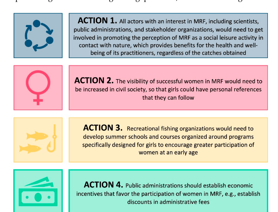
Figure 2. Key actions of the agreed roadmap to gender equality in marine recreational fisheries.

After the participatory session at the GT PMR workshop, four key actions were agreed upon to begin to reduce the gender gap in MRF, as we show in Figure 2.