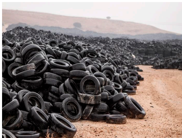
Figure 1. Stockpiled ELT wastes in a dumpsite.