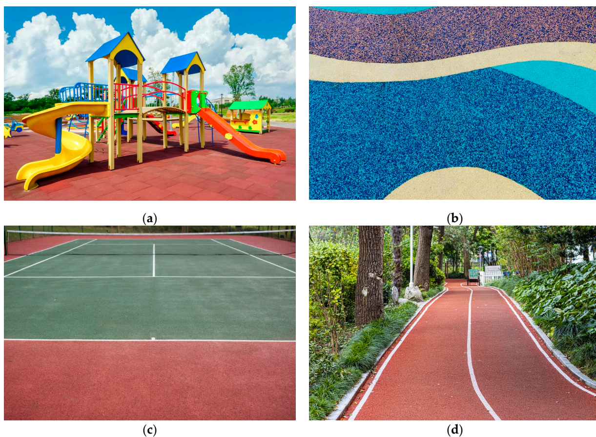
Figure 3. Examples of ELT rubber in construction applications: (a) playground, (b) colored mat, (c) tennis court, and (d) jogging path.

Recently, recycled ELT products have become very popular with builders and designers across all facets of new construction projects. This is because of their excellent durability, impact absorption, safety and comfort, easy installation, low maintenance requirements, and long-term cost-effectiveness. Typical examples include jogging paths, playgrounds, tennis courts, etc. (Figure 3). Other products related to the maintenance and operation of infrastructure, such as traffic-related products, highway crash barriers, etc., were also developed. A recent Transparency Market Research report suggested that the global market for recycled ELT products, including construction and other areas of application, was valued at $5.3 billion in 2021. The report also indicated that this global market is expected to grow to $7.04 billion by 2031 [79].