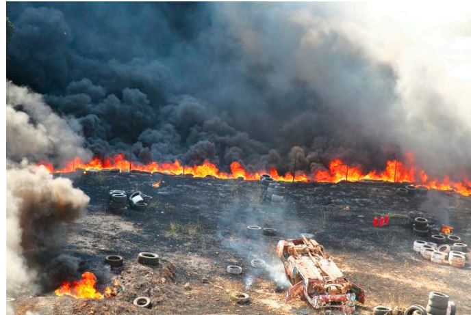
Figure 2. A fire incident in an ELT stockpile site generates black smoke and other pollutants.

large processing plants having high operational costs and limited large-scale industrial applications [26]. In contrast, the use of ELT wastes in construction has become very popular in recent years due to their attractive and promising material properties such as long-term durability/stability, good insulation (acoustic and thermal), low density, low earth pressure, high compressibility, and good drainage capability.