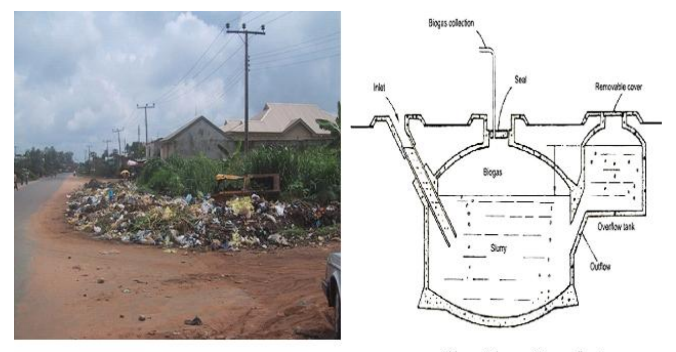
Figure 3. Biogas in China [10]. (Reproduced with permission from "Biogas in China"; published by "Institute of Science in Society (ISIS)", 2006).

For a bio-dependent culture, it is not a surprise that much of the rural community's waste is biodegradable. This situation presents great opportunities to employ biomass technologies, such as "digesters" to generate biogas as a sustainable byproduct. An example of a Chinese biomass dome digester [10] is shown in Figure 3. One byproduct of biomass technologies is biogas. Biogas is described as [11] "a combustible mixture of gases produced by micro-organisms when livestock manure and other biological wastes are allowed to ferment in the absence of air in closed containers". The major constituent of biogas is methane.