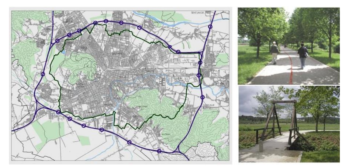
Figure 4. A holistic case of sustainable infrastructure "The path (POT)", Slovenia [31], describes a circular memorial park around the city of Ljubljana, Slovenia.

The assessment matrix was used by the members of the local authority responsible for the POT project (Figure 5). The local authority members were assisted by external experts and by national member(s) of COST C8 project. Also, the stakeholders' values were integrated in the POT project team as much as possible; partly by having core decisions within the local authority taken by the democratically elected city councilors that are responsible for decisions to their voters (stakeholders) and partly by public consultations with stakeholders implemented during the planning process based on the principle of Aarhus convention [32]. The answers to the questions in each sustainability field column were provided by Delphi method. The goals and priorities of local authority, stakeholders' aims, and external experts' knowledge were represented in the expert panel for assessment of the above case study. The assessment was completed after the second panel meeting. The results obtained in the matrix demonstrated a favorable perception of sustainability of the memorial circular "the Path (POT)" around the city.