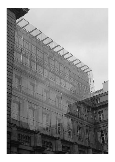
Figure 2. Aluminium based cladding system in an historical building.

There are also facade and roof systems where aluminium is used in window and glazing frames and glazing spacers. The function of these systems is to provide daylight, visual contact between the exterior and the interior, provide protection against the weather (rain and wind), provide passive solar heating gains, help keep interior thermal comfort, and keep the energy use for operation at a minimum.