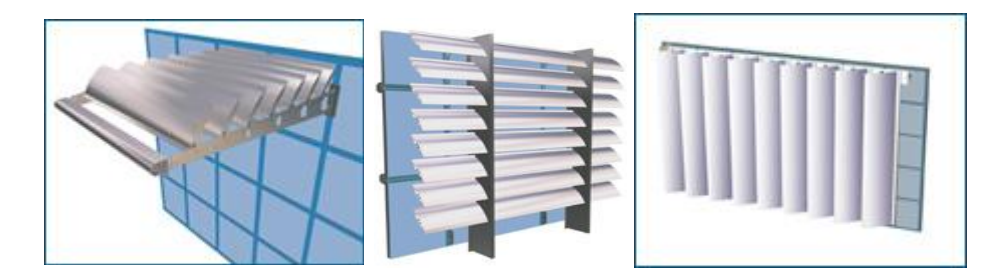
Figure 4. Shading systems [14].

Aluminium is used also in window frames where it provides flexible and popular window geometry and operation. Since aluminium is a good heat conductor, it is necessary to use proper thermal breaks for enhanced thermal performance. Regarding insulation, it offers high levels of heat and noise insulation and the flexible design of systems used in doors and windows enables a choice of traditional or modern structures. Aluminium is a material that does not wear out in time, thus ensuring the longevity of frames. It is also appropriate for areas with high temperatures and intense sunlight. The maintenance and care of frames is quite easy, and they can be cleaned periodically. Aluminium is of