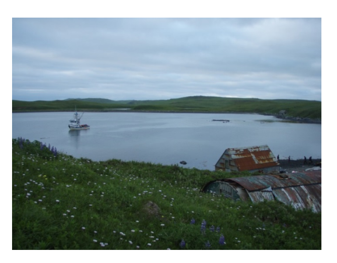
Figure 3. A commercial fishing boat owned by a member of the Sanak Corporation and Pauloff Harbor Tribe in Pauloff Harbor on Sanak Island. Part of the abandoned town site is in the foreground.

These combined data are used to carry the reader through the major historical time slices of Sanak Island highlighting population shifts, regional interactions, resource use, and Aleut sociocultural responses to changes. The purpose is to describe the historical trajectory that created the present conditions of separation, demonstrate the heritage resources the current population draws on for identity and attachments, and describe the transition from a place-based to a place-focused identity through the creation of a cultural land trust. Sanak Island witnessed intensive development of a succession of industries, each followed by periods of relatively low use, and finally recourse to subsistence use from distant villages. The past few centuries of Sanak Island life can be summarized as shifting local-global economic patterns surrounding sea otters, cod, salmon, fox farming, and cattle ranching under waves of Russian, American, and Scandinavian authority and/or influence, followed by local commercial and subsistence fisheries. This move from an industrial heritage to contemporary local subsistence economies facilitated by a commercial fishing industry is a unique reversal of development in the region, and has strong implications for the dialogue on heritage and sustainability