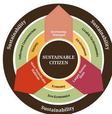
Figure 1. The citizen-centric, “education for sustainability” model emphasizes change in attitudes, skills and behaviors of students in addition to knowledge acquisition. The model also highlights how students are taught to grow their use of democratic dialoguing, think in increasingly larger system sizes and build more sustainable habits.

To address the need for increased community dialoguing in the context of sustainability and in support of fostering more meaningful community engagement, we developed an Introduction to Sustainability service-learning course that emphasizes sustainability knowledge, skills and behaviors as means to shape one vision of a sustainable citizen. Our goal was to address the idea of sustainability in a holistic fashion and to enable students to tackle wicked problems systematically. Course content is structured to present citizenship with “a social dimension that goes far beyond just residency—It encompasses all aspects of what it means to be a full member of a community” [13]. In addition, this course is designed to move curriculum beyond “education about sustainability” and closer towards a model of “education for sustainability” [3]. The course promotes basic skills of sustainability literacy, applied math and finding information as students are challenged to increase their abilities toward democratic dialoguing and with attention to increasingly larger system sizes. The traditional sustainability knowledge areas of society, economy and environment are explored before moving toward more blended-knowledge themes, such as informed consumerism, eco-economies and livable environments. Most importantly, the “bull’s-eye” of the course framework is a person—One who is aware, informed and action-oriented (Figure 1).