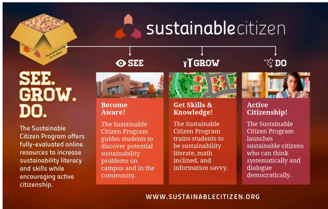
Figure 2. Students in the Introduction to Sustainability course are encouraged to See, Grow and Do as they Become Aware, Get Skills and Knowledge and practice Active Citizenship. Marketing materials developed for the Sustainable Citizen Program (FIPSE Grant P116B100078) are used to emphasize these key conceptualizations in an engaging manner.

The goal of this research was to explore student conceptions of sustainability in the context of key instructional design elements. We viewed these conceptions as complex products of abstract or reflective thinking or as the sum of a student's ideas and beliefs concerning sustainability [14]. We hypothesized that three particular conceptions would emerge from an analysis of student surveys and coursework given the strong instructional, and almost propagandized, emphasis to “Become Aware”, to “Get Skills & Knowledge”, and on “Active Citizenship” as a pathway toward becoming a “sustainable citizen” (Figure 2).