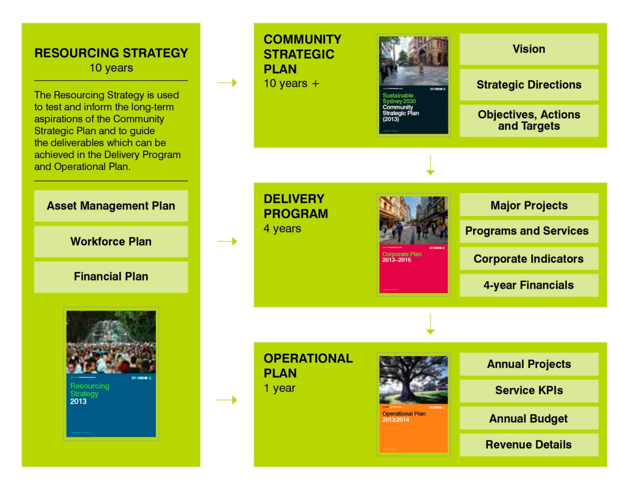
Figure 2. Implementation framework of Sustainable Sydney 2030. Source: [33] (p. 21).