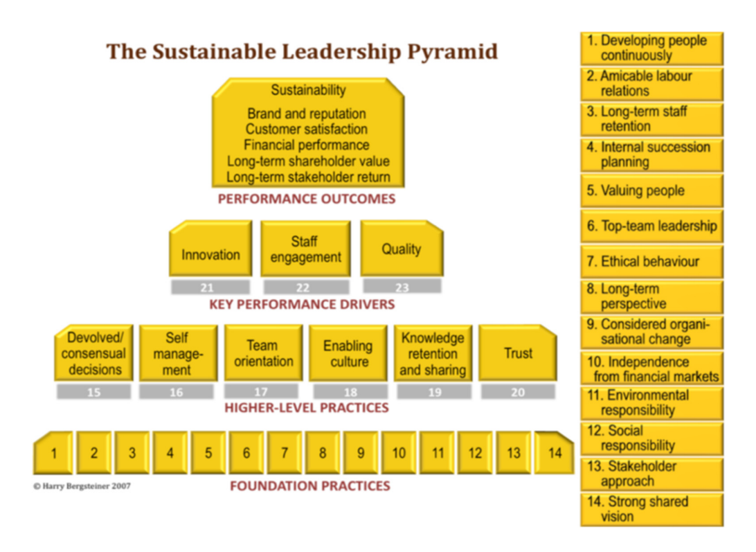
Figure A1. The Sustainable Leadership Pyramid containing 23 Honeybee practices for Sustainable Leaders.