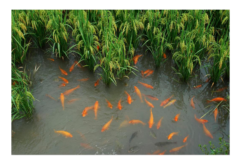
Figure 1. Qingtian Rice-Fish Culture System.

China is one of the first countries that responded to the GIAHS initiative. In June 2005, Rice-Fish Culture in Qingtian County, Zhejiang Province (Figure 1) was designated as one of the first six GIAHS pilot sites in the world [12,13]. In February 2009, the start-up meeting for the conservation and adaptive management of GIAHS China Rice-Fish Culture was held in Beijing. This marked that the FAO GIAHS project supported by Global Environment Facility (GEF) formally started up in China [11]. With the help of FAO, a national framework for the GIAHS conservation and management was formulated and established in China [13], which provided strong support not only for the conservation and management of Rice-Fish Culture but also for the exploration and identification of other agricultural heritage systems. The concept of Nationally Important Agricultural Heritage Systems (NIAHS) was first put forward in this framework. Specifically, a nationally accepted system for recognition of NIAHS was demonstrated; lessons and practices learned from the promotion of the effective management of pilot sites were required to be widely disseminated to support the expansion and up-scaling of NIAHS; and the creation of a NIAHS network was suggested in the framework [13].