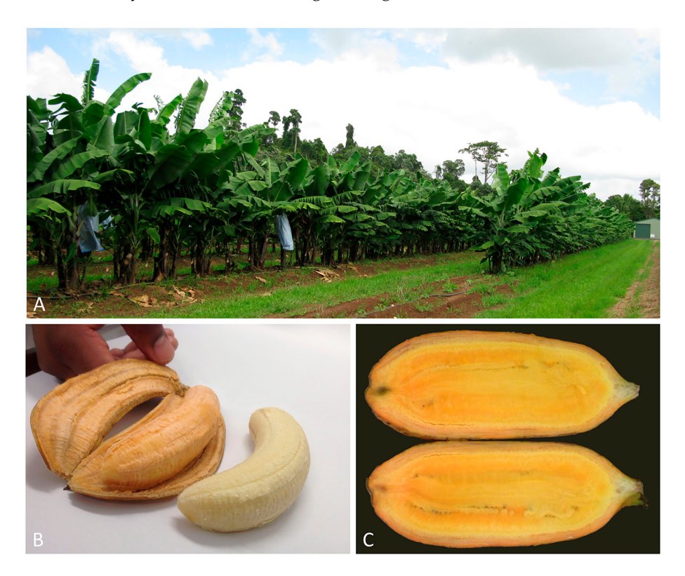
Figure 3. Bananas can be genetically modified to accumulate elevated levels of pro-vitamin A (PVA) in fruit. ( A ) Field trial of PVA-biofortified "Cavendish" banana plants in Australia; ( B ) PVA-biofortified fruit (left) compared to wild-type fruit (right); ( C ) F'i type bananas, such as "Asupina", naturally accumulate high levels of PVA and are a source of useful genes for biofortification.

Banana Xanthomonas wilt has caused massive losses in East Africa. There are no accessible BXW resistance genes available and GM was clearly the most appropriate strategy to curtail this devastating disease. A team from the International Institute for Tropical Agriculture and the National Agricultural Research Organisation of Uganda have utilised two genes from sweet pepper that are involved in enhancing bacterial resistance, to develop genetically modified bananas and progress these through to the field. The two genes, the hypersensitive response-assisting protein gene ( Hrap ) and the plant