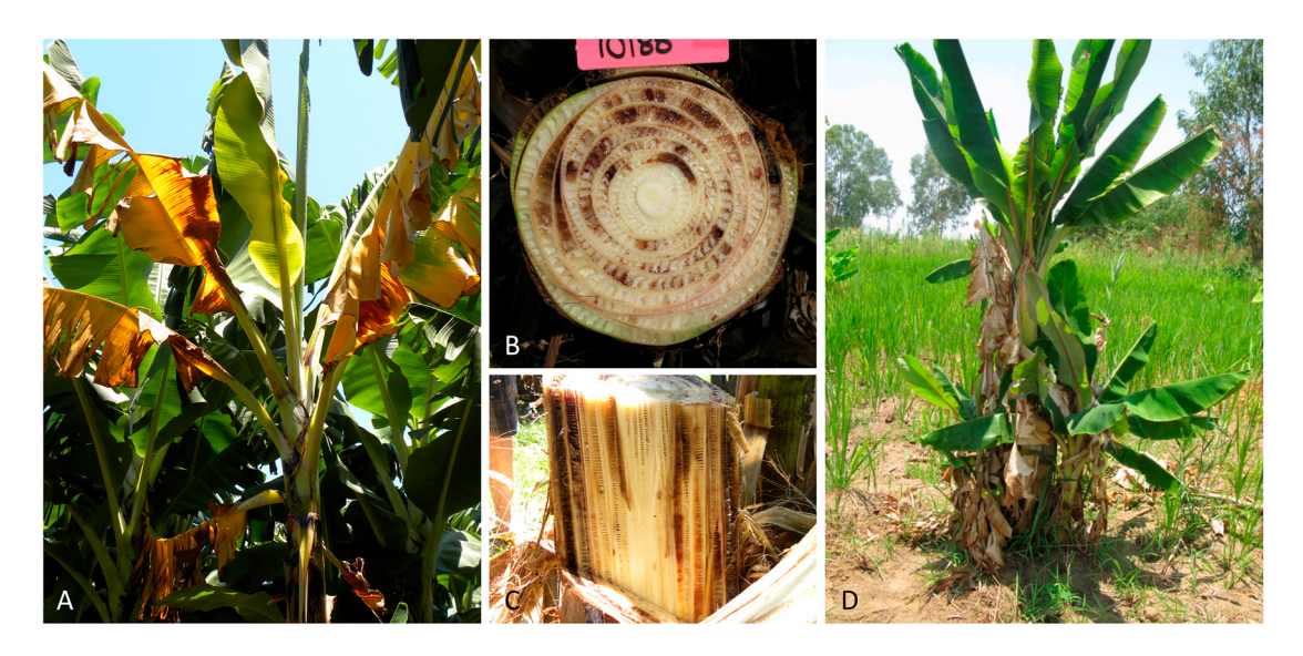
Figure 1. Banana plants are susceptible to several fungal and viral diseases. (A) External symptoms; and (B,C) characteristic internal vascular discoloration caused by Fusarium wilt tropical race 4 (TR4); (D) Characteristic symptoms of banana bunchy top disease.

Believed to have originated in Indonesia [13], it is now widespread in south-east Asia, including China, Taiwan, and the Philippines [8], where it is threatening both the Cavendish export industry and the local Lakatan production [14]. It is also present in northern Australia [8,15]. Additionally, this disease is on the move. It has recently been recorded in Pakistan near the Indian border [16], Lebanon [17] and Jordan in the Middle East [18], and Mozambique in Africa [19]. Some tolerant, but not resistant, selections from Cavendish have been reported [20].